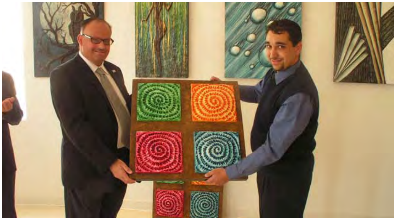
An exhibition being held in the new exhibition hall.