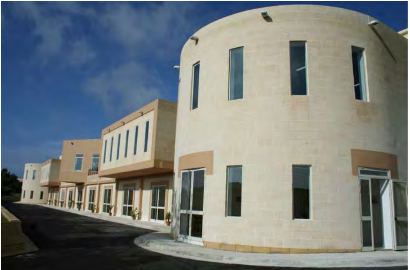
The exterior of the new school of art.

A new exhibition hall offers a unique opportunity for those who wish to display their work. A papier-mâché exhibition, an art exhibition set up by the special needs students' class, a Christmas exhibition displaying Christmas related exhibits, an international lace exhibition set up by the Artofil Lace School in Belgium, an Easter exhibition and a lace exhibition as part of the Leonardo Da Vinci Lace Project are a few of the most recent exhibitions which have made use of this location. The school also aims to promote Gozo as an 'Island of Culture' through participation in foreign exhibitions such as the ones which were set up in Spain, Portugal, Italy and most recently in Belgium.