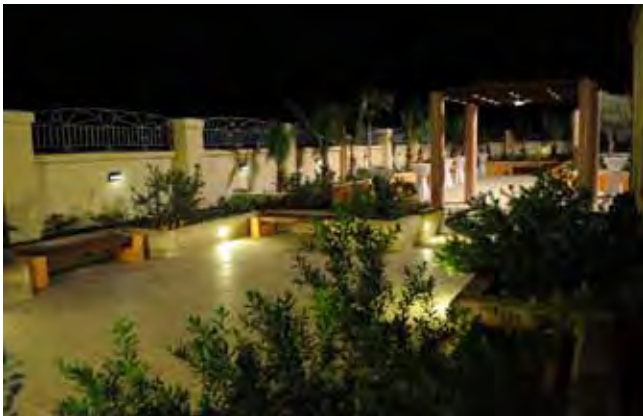
A general view of Ġnien il-hena.