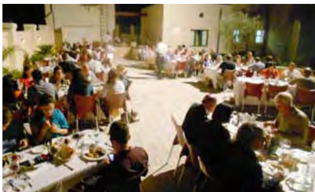
The guests during the traditional meal.