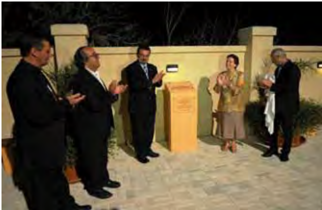
The inauguration of Ġnien il-hena.