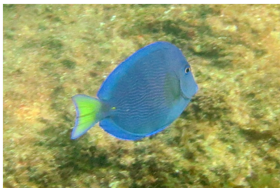
Figure 2. Photograph of the Acanthurus coeruleus individual sighted in Marsamxett Harbour, Malta, in October 2013.