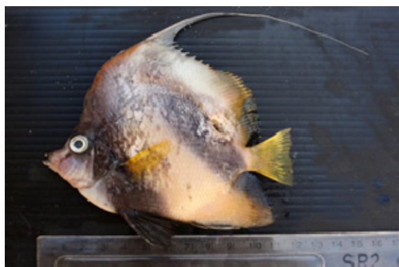
Figure 3. Photograph of the specimen of Heniochus intermedius caught from the Grand Harbour, Malta, in November 2014.

sighted in 2011 in Cyprus (Langeneck et al. 2012); and Acanthurus chirurgus (Bloch, 1787), recorded from off Elba Island, Tyrrhenian Sea in 2012 (Langeneck et al. 2015). Three species come from the Red Sea: Heniochus intermedius Steindachner, 1893, first found in 2002 in Turkey (Gökoglu et al. 2003); and Chaetodon austriacus Rüppell, 1836 and Chaetodon larvatus Cuvier, 1831, both recorded in 2011 from Israel (Goren et al. 2011; Salameh et al. 2011). Finally, one Pacific species, Zebrasoma flavescens (Bennett, 1828), was reported from the Balearic Sea, near Sitges (Spain), in 2008 (Weitzmann et al. 2015).