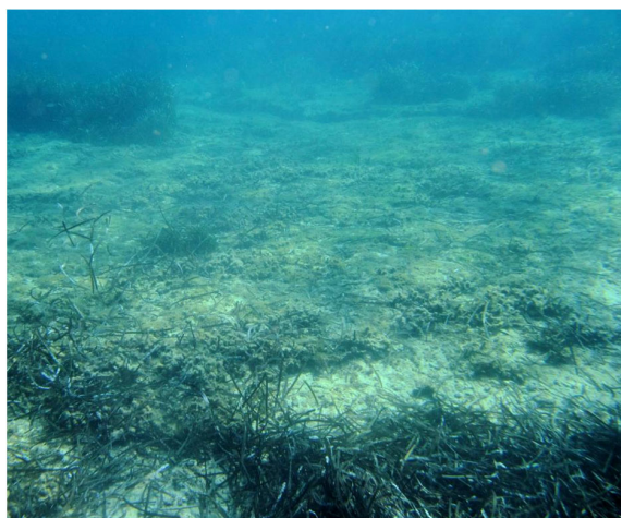
Figure 4. Habitat of Caulerpa taxifolia var. distichophylla at White Rocks, northeastern Malta. The algae occurred within assemblages of photophilic algae adjacent to stands of Posidonia oceanica on rock at depths of 4-6m.