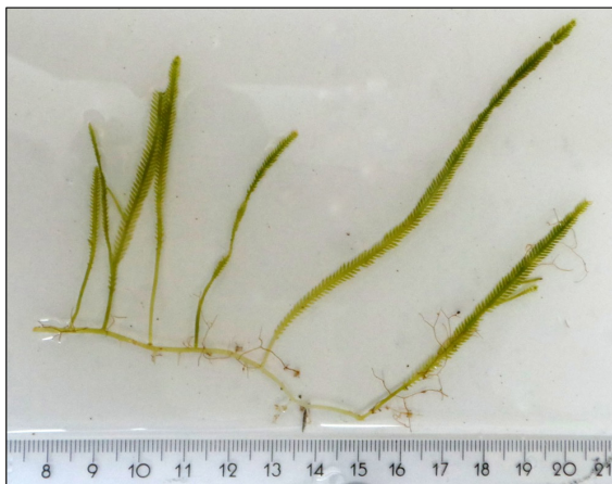
Figure 2. Caulerpa taxifolia var. distichophylla collected from Exiles, Sliema.

(3.9 km linear distance) (Figure 1) (where small patches were reported in July 2014) was also surveyed.