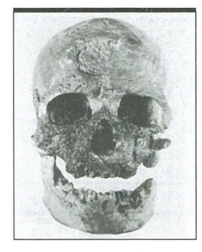
This Cro-Magnon skull was broader than the early central Mediterranean dolichocephalic type. (I.C.D. exhibition of photos, Paris 1979)

In Genesis 1:26 we read 'And God said, Let us make Man in our image, after our likeness: and let them have dominion over the fish of the sea, over the fowl of the air and over the cattle and over everything that creeps upon the earth'. Our belief in divine creation involves a supernatural agency.