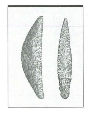
Drawings: In Prehistoric times sharpened flints were used as sickles (left) and to perform trepanation or to remove a superficial growth on the skin. (right)

Two rather young skull bones found under strata of soil at Fontechevade, to the west of Angouleme throw some more light on ancient man. These have fairly small brow ridges and a brain capacity of almost 1450 c.c. which are almost similar to present day human brains. The flint tools found with them were dated to between 120,000 and 180,000 years ago. Taken together the Fontechevade