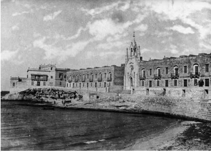
Fig. 4: First church of 'Our Lady of Mount Carmel', Balluta, St Julians 1858-1859 (demolished in 1875)