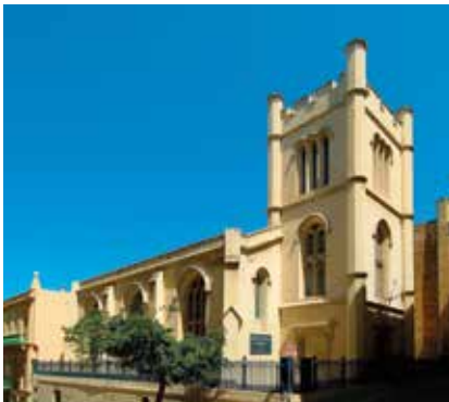
Fig. 2: St Andrew's Scots church, South Street, Valletta, 1856-1857