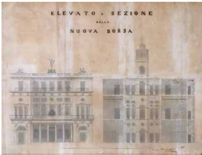
Fig. 6: Drawing signed by Bonavia and bearing the date 1857, entitled Elevato e Sezione della Nuova Borsa