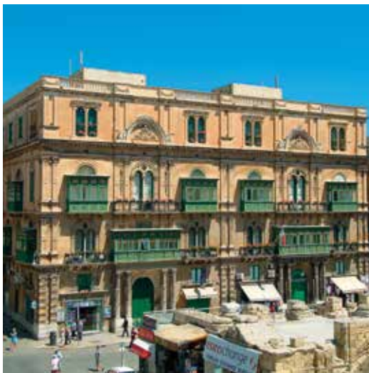
Fig. 9: Buttigieg-Francia Palace, Republic Street, Valletta