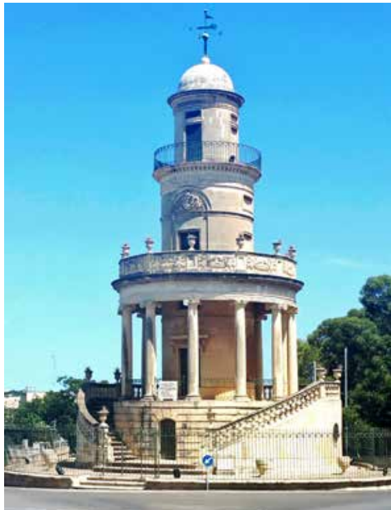
Fig. 12: Gourgion belvedere tower, Lija