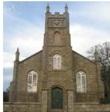
Fig. 3: Udny parish church, Udny Green, Aberdeenshire, Scotland, 1821