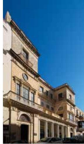
Fig. 5: The Borsa, Exchange building, Republic Street, Valletta 1857