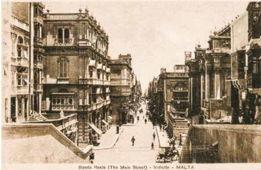
Fig. 8: Buttigieg-Francia Palace, Republic Street, Valletta, 1875-1876