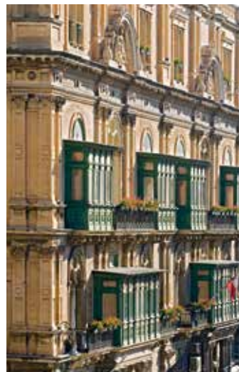
Fig. 10: Buttigieg-Francia Palace, Republic Street, Valletta