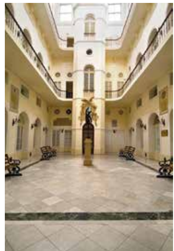
Fig. 7: Internal court of The Borsa, Exchange Building