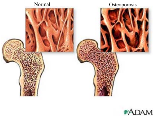
Fig. 4: Cross-section of bone showing increased spaces within trabecular bone and thinning of bone