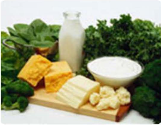
Fig. 1: Foods rich in calcium