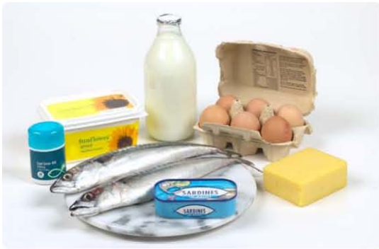
Fig. 2: Foods rich in vitamin D

doses chronically, apoptosis of osteoblasts and osteocytes and inhibition of osteoblast proliferation occurs resulting in osteoporosis (Karaplis, 2008).