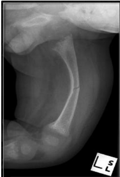
Fig. 5: A radiograph showing left femur bowing and an incomplete fracture