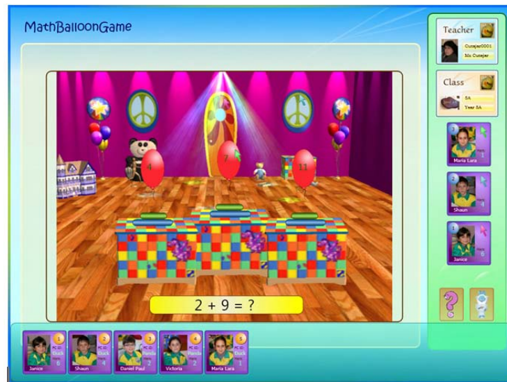
Fig. 4: The MathBallooGame deployed within the student client

the applications. The sample applications illustrated the possibility of having a wide variety of activities that can be followed in a class.