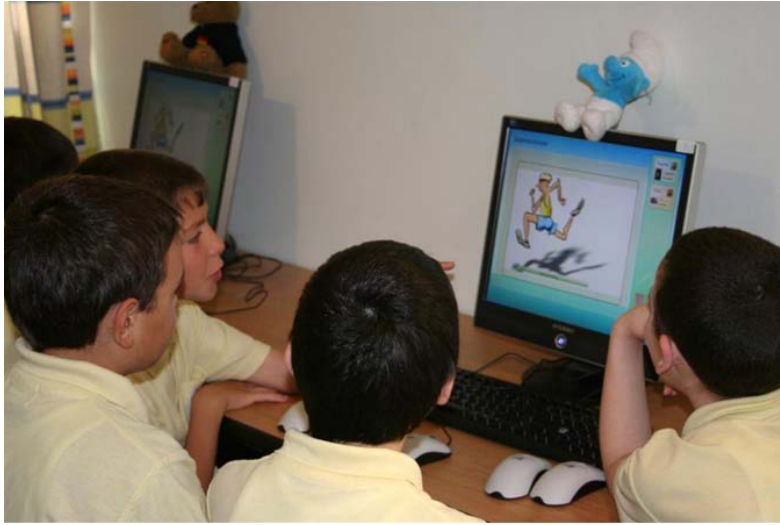
Fig. 3: Students attentively follow an educational slideshow presentation about nutrition

same idea as WhiteBoard , but instead of having the teacher as the centre of attention in the class, we have the students trying to explain words to each other through illustrations by means of an engaging Pictionary-like game which encourages collaboration and competitiveness amongst the students.