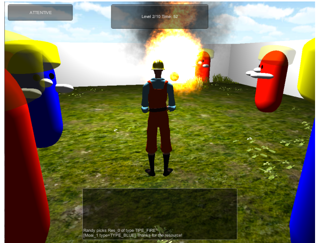
Figure 3: A screenshot of the Resource Management Game. The player character, one resource item and several NPCs are visible.

As an initial step towards our system, we developed a simple mini-game based on resource management conflicts. This game takes place in a single-player 3D environment populated by dummy NPCs and resources, in the form of fireballs, as shown in Figure 3. There are two types of NPCs differentiated by colour, reds and blues; and each has a level of happiness, ranging continuously from 1 to 0, decreasing constantly over time. Fireballs provide NPCs with happiness ranging from 0 to 1. The task of the player is to distribute fireballs among the NPCs under time constraints. The maximum score (i.e., degree of fair distribution) is obtained when the two populations of NPCs have an identical average happiness. The game is composed of 10 levels; at the end of