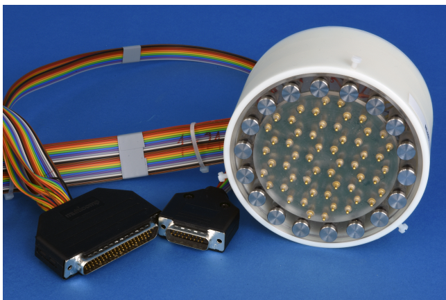
Figure 2: Sensing head of the EIM device developed at the University of Mainz in collaboration with the University of Malta and Oxford Brookes University.