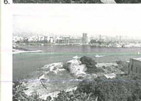
1. - 4. Parked cars block the view of some buildings, and take spaces away from the pedestrian. 5. Umbrellas, tables and chairs cluttering Pjazza Regina. 6. and 7. Neglected parts of Valletta's fortifications