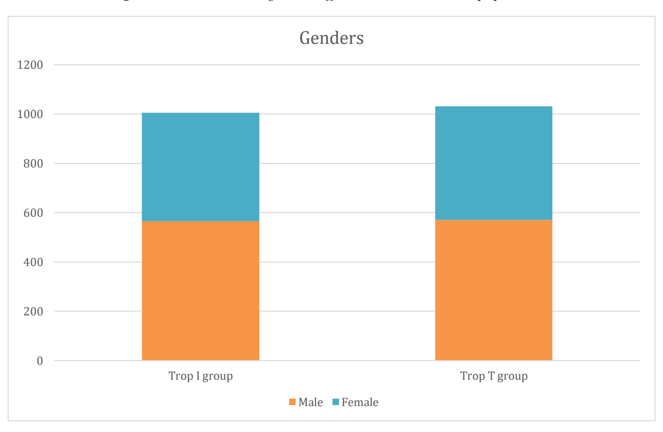
Figure 2: Illustrates the gender differences between both populations

The average length of stay for patients being investigated for suspected Acute Coronary Syndrome whilst using the Troponin I assay was 7.16 days, with a median length of 3 days, and this was reduced to 6.42 days with a median length of 2 days after the introduction of the new high-sensitivity Troponin T assay. This was an average reduction in length of stay of 0.74 days per hospital patient admission (18 hours approximately).