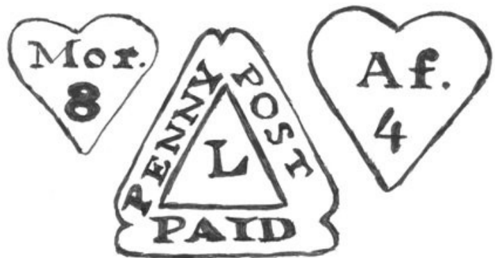
Fig. 1 – Examples of Dockwra's postmarks

Four types of a triangular postmarks were used but nowadays most the few that survived are in museums archives. The triangular shaped postmark is considered by philatelists as the world's first postage stamp.