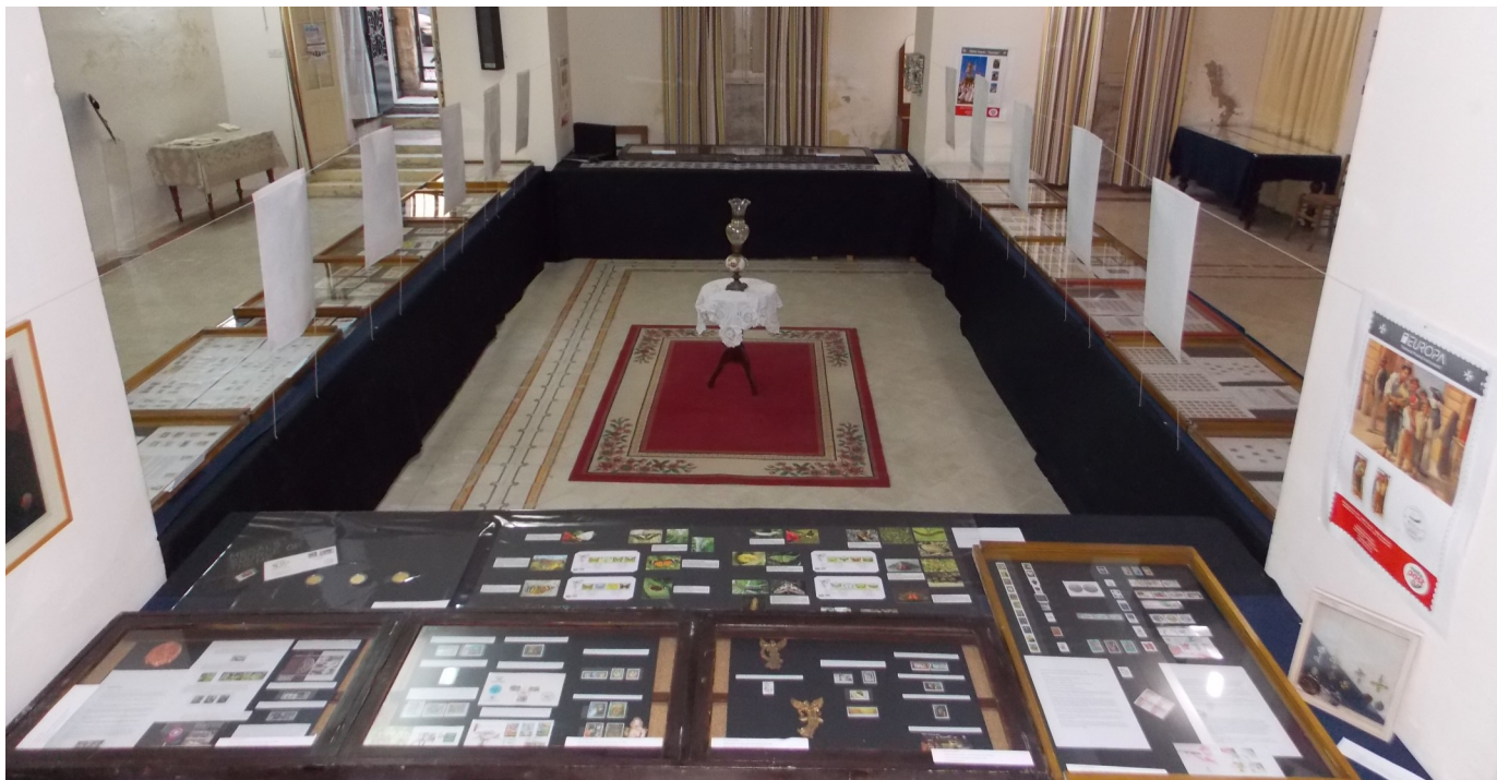
Il-wirja annwali tal-filatelija mill-Gupp Filateliku taż-Żejtun, L-Istorja t'Artna u lil hinn Minnha , fis-sena 2016 fis-Sala Ġużepina Curmi