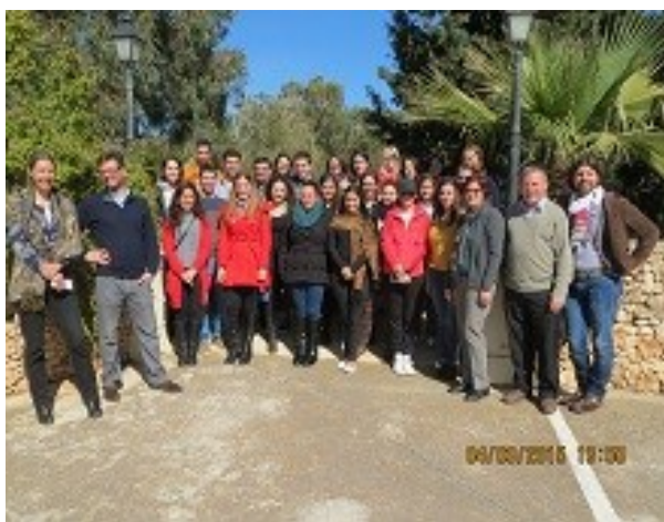
Third year BA (European Studies) students and the Institute's academic staff in Gozo