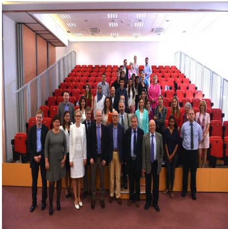
Participants of the seminar 'Small States in the EU: Passive Policy Takers or Industrious Agenda Setters?' held on 11 May

The Institute for European Studies was appointed the local co-ordinator of the project 'Small States in Europe: Opportunities and Challenges' in March 2015. The project is led by the Centre for Small State Studies at the University of Iceland, while the University of Malta is one of the partners in this project alongside the University of Copenhagen; the University of St. Andrews; Vilnius University and Tallinn University of Technology.