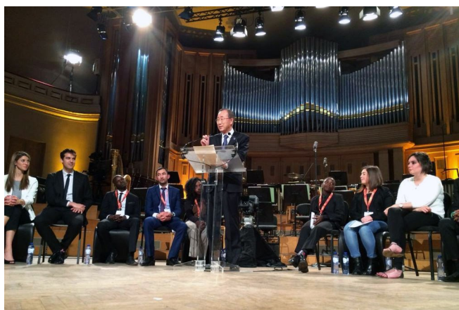
Mr Ban Ki-moon addressing the audience at the Palais des Beaux-Arts

2015 development agenda is also set to be agreed at the United Nations, including the adoption of the Sustainable Development Goals that will replace the Millennium Development Goals.