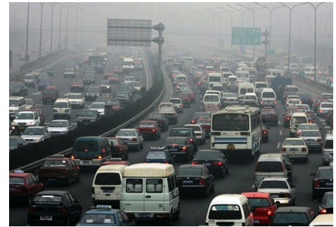
Information edited by Stefano Moncada and adapted from Climate-L.org

The Council of the EU has adopted Conclusions in response to the European Commission communication “ A Blueprint to Safeguard Europe’s Water Resources ,” which call for better implementation of existing water legislation, including integration of water policy into other policy areas, such as agriculture, renewable energy and integrated disaster management. (more on http://www.consilium.europa.eu/homepage/highlights/safer-management-of-europes-water-resources?lang=en ).