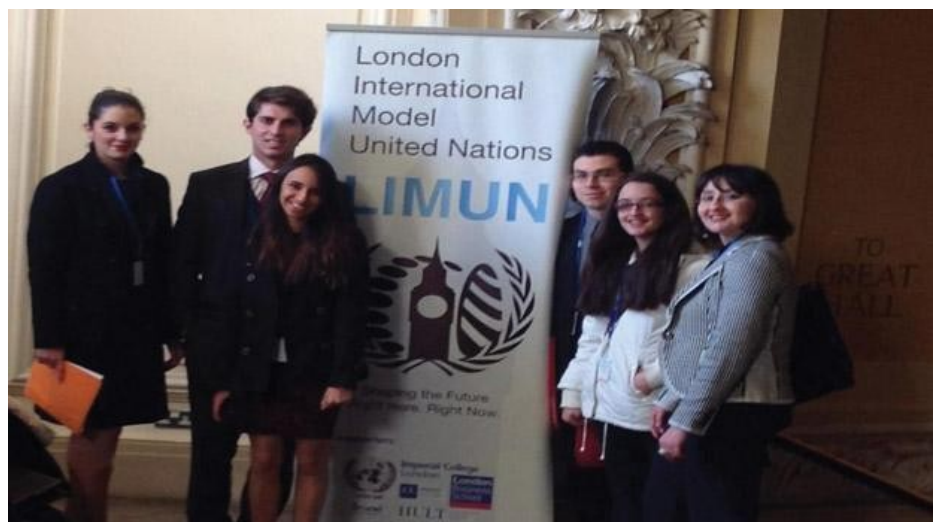
Photo: The Maltese delegation at LIMUN 2013