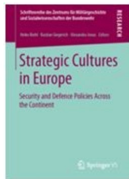
Above: Strategic Cultures in Europe - ISBN 978-3-658-01168-0