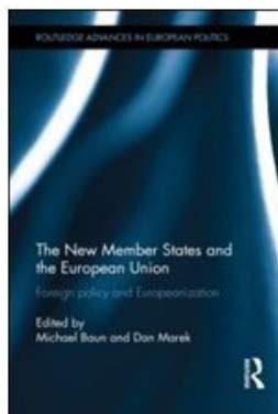
Above: The New Member States and the European Union: Foreign Policy and Europeanization - ISBN 978-0415679275

European countries work together in crisis management, conflict prevention and many other aspects of security and defence policy. Closer cooperation in this policy arena seems to be the only viable way forward to address contemporary security challenges. Yet, despite the repeated interaction, fundamental assumptions about security and defence remain remarkably distinct across European nations. This book offers a comparative analysis of the security and defence policies of all 27 EU member states and Turkey, drawing on the concept of 'strategic culture', in order to examine the chances and obstacles for closer security and defence cooperation across the continent. Along the lines of a consistent analytical framework, international experts provide case studies of the current security and defence policies in Europe as well as their historical and cultural roots.