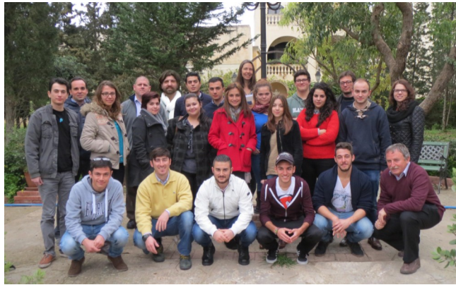
Above: The students and lecturers who participated in Gozo V