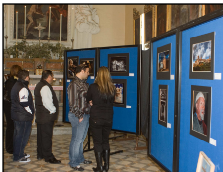
A mini-photographic exhibition was put up by the society at St. John the Baptist Chapel at Gharghur during the Good Friday Procession on 5th April 2009.