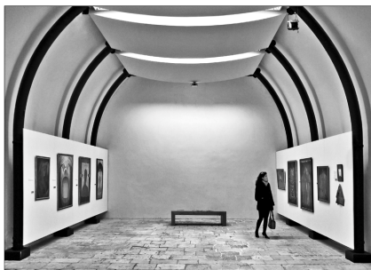
ISF Diploma Charles Grixti - Curves