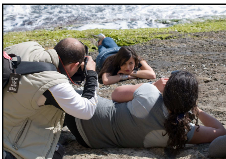
One of the most popular activities organised by the society was the photoshoot with models which was held on 19th March 2009 in Valletta.