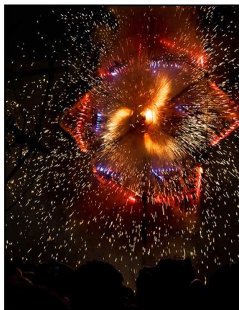
First in the Mqabba Lily Firework Photo Competition