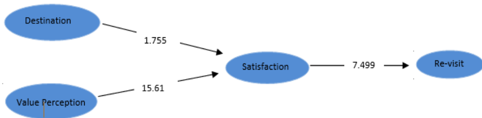
Figure 2. Research Model

The Smart PLS 3.0 and two-step analysis approach as suggested by Gerbing and Anderson (1988) were adopted to analyze the data. Following the suggestions of some studies (Chin, 1998; Gil-Garcia, 2008) the bootstrapping method (500 resample) was also carried out to determine the significance levels for the loadings, weight and path coefficients. Figure 2 illustrates the research model.