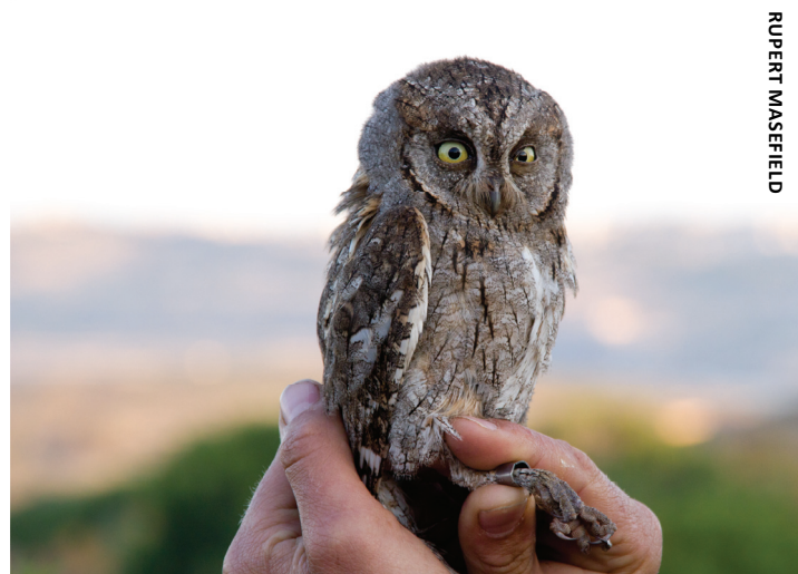
A SCOPS OWL RINGED ON COMINO