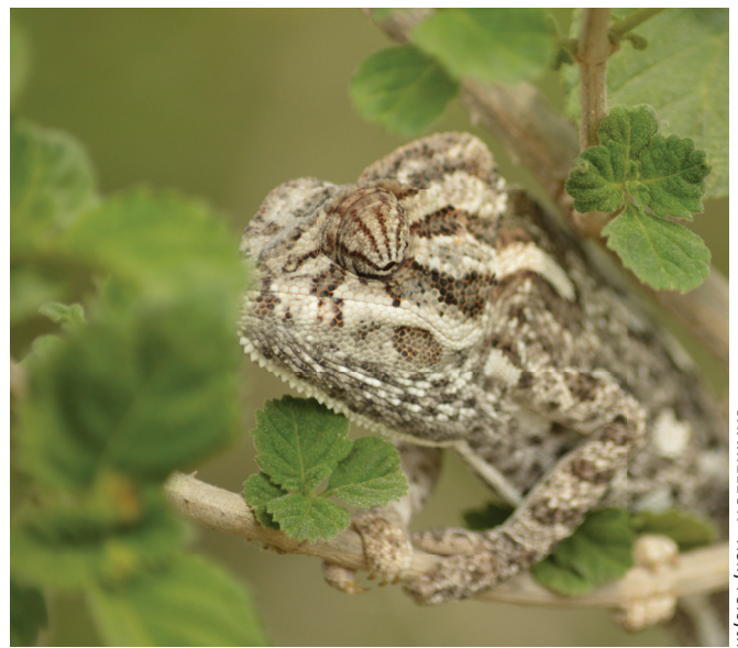
CHAMELEON - Holly Forsyth

For further information or for bookings please email events@birdlifemalta.org or call +356 79028782