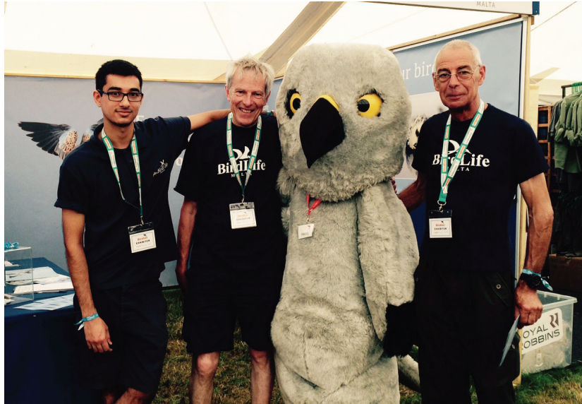
BIRDLIFE VOLUNTEERS MEET HENRY HEN HARRIER AT BIRDFAIR Birders Against Wildlife Crime