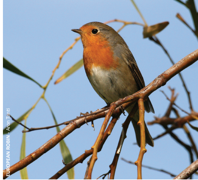
EUROPEAN ROBIN - Aron Tanti