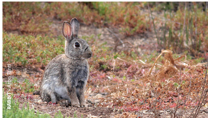
RABBIT - Aron Tanti