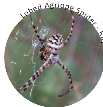
Lobed Agriope Spider - Ray Vella

Although they look similar, female lobed argiope spiders are over 3 times as big as males. The female's body is around 25mm long, while the males are a tiny 7mm in comparison. They both have a striking, yellow and black striped abdomen. They spin large webs in which to catch their prey, usually other insects, which they poison before eating. Luckily, as with most other spiders, this poison is not toxic to humans. Look out for them in areas such as the Dwerja Lines or Miżieb.