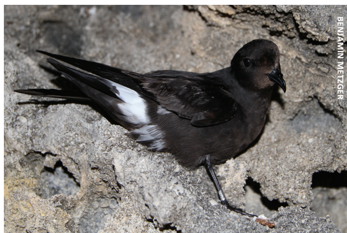
A STORM PETREL, RINGED ON FILFLA

In Malta, we have recovered birds that have been ringed in dozens of European and African countries.