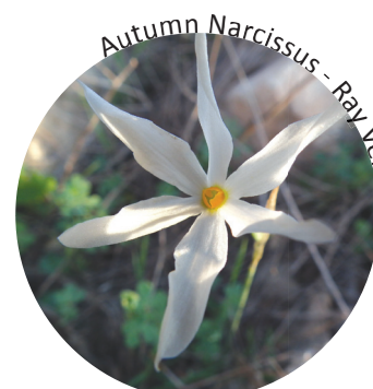
Autumn Narcissus

This common little flower will brighten up an autumn walk, but if you want to see it you'd better be quick as the delicate flowers only last for the month of October each year. A member of the daffodil family, it grows to a height of about 20cm. Look for the tiny white flowers along cliff tops and garrigue. Take a walk around Red Tower, Mellieħa or nearby Majjistral Park, both are good sites to find these pretty flowers.