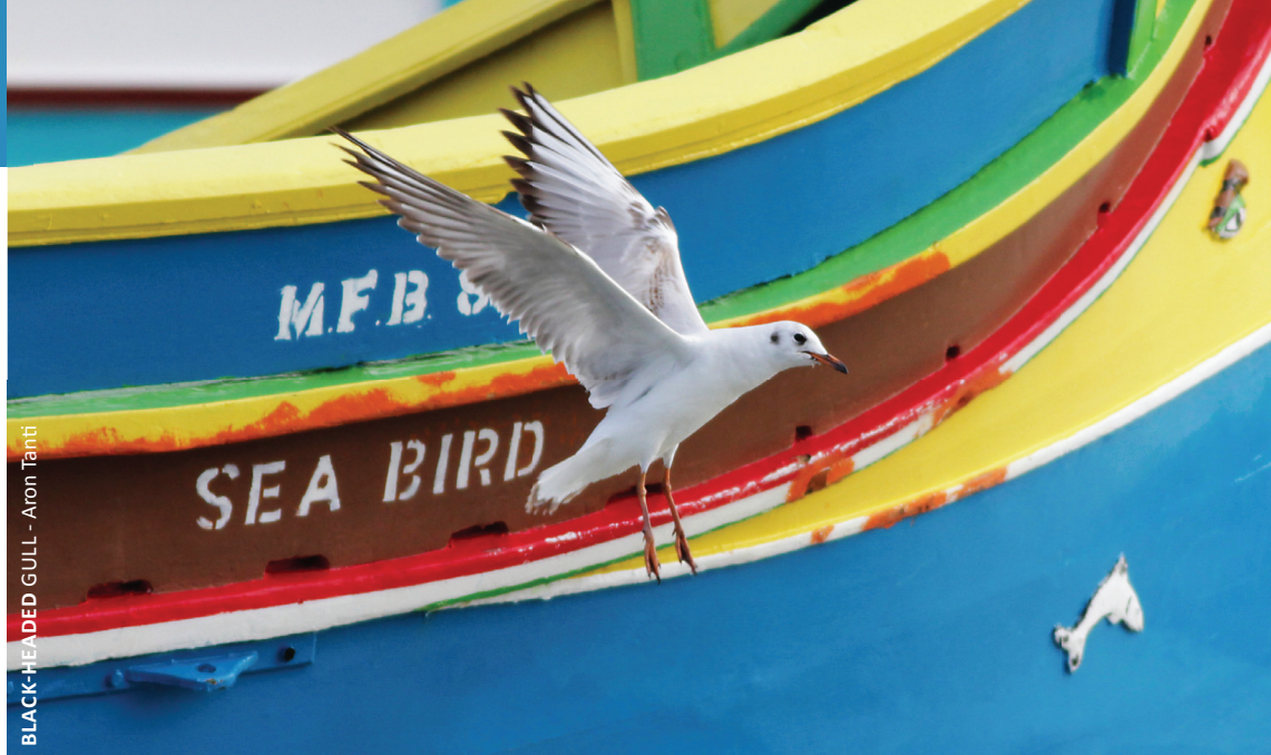
BLACK-HEADED GULL - Aron Tarnti