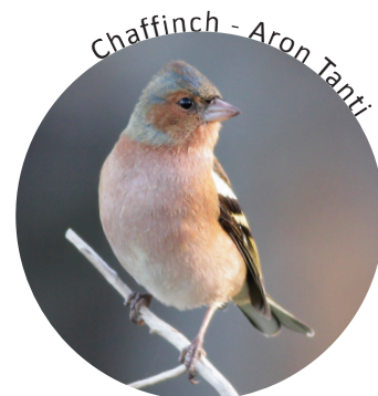
Chaffinch - Aron Tanti

These birds are autumn and winter visitors to Malta, leaving behind the cold weather of mainland Europe for our milder winter. They are typically found in woodland, such as Buskett or Foresta 2000. Look out for a tell tale flash of white on their wings as they fly past. The males are much more colourful birds, with an orange chest and blue cap on their head, while females are brown. Chaffinches have short, stout beaks that are perfectly designed to help them crack open seeds. You may also see them catching insects in mid air, returning to a nearby branch to eat them.