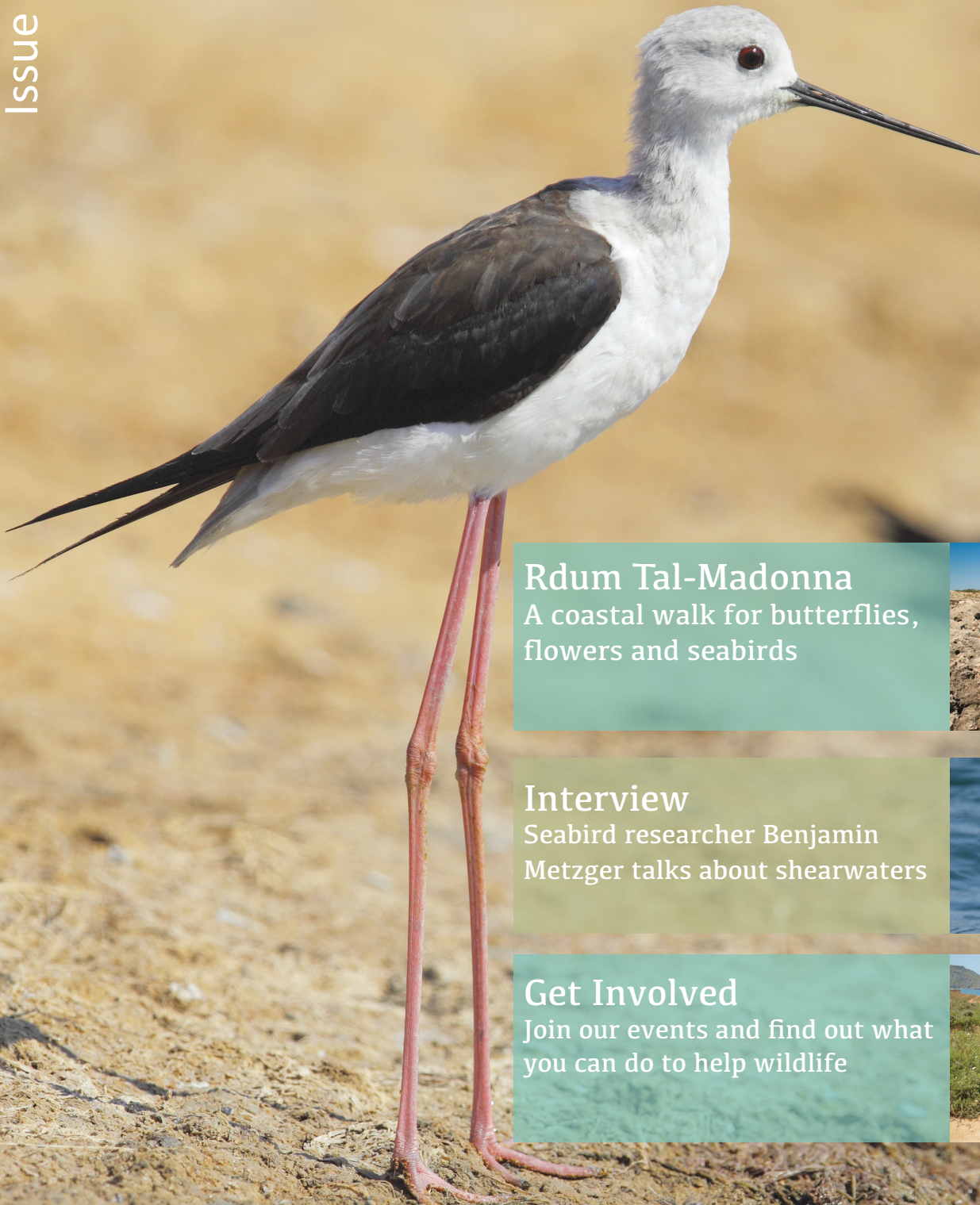
BLACK-WINGED STILT - Denis Cachia

Rdum Tal-Madonna A coastal walk for butterflies, flowers and seabirds