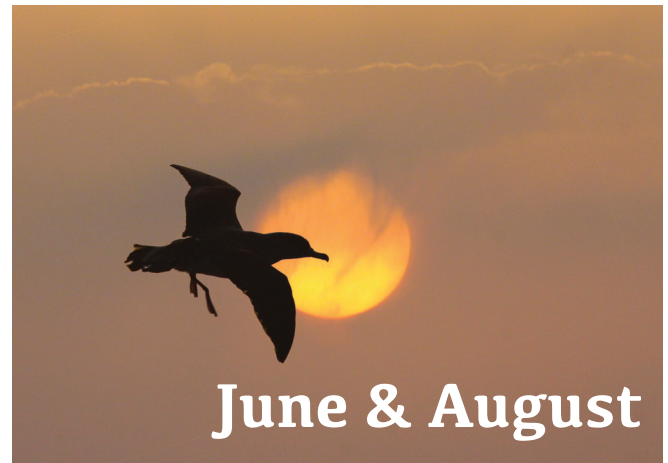
SHEARWATER - Aron Tanti