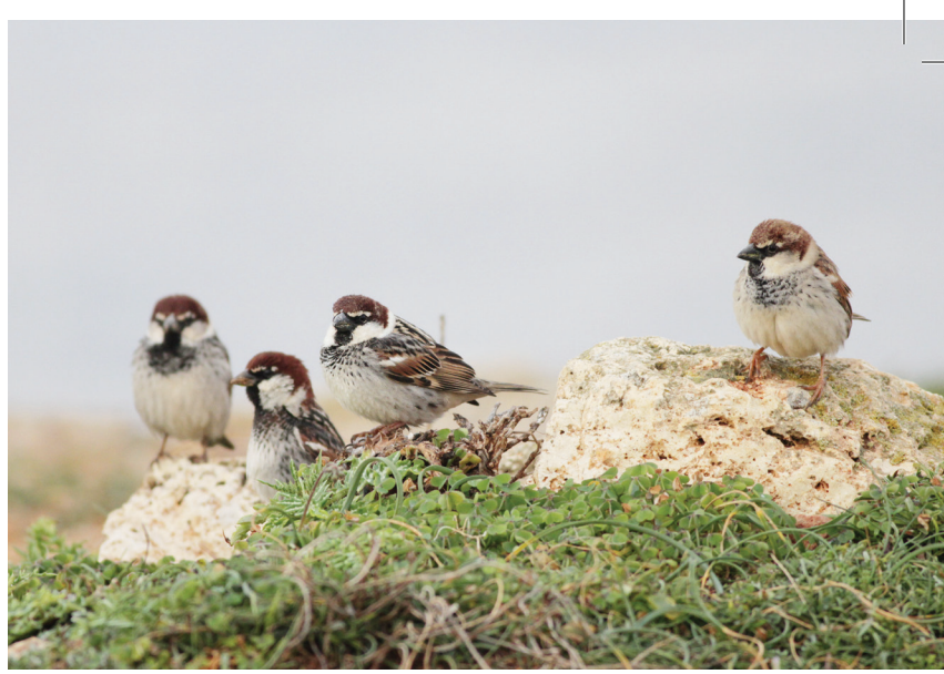
SOCIABLE SPANISH SPARROWS