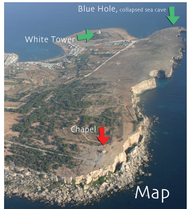
RĐUM TAL-MADONNA FROM THE AIR