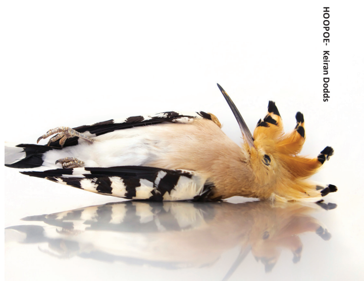
HOPOE - Keiran Dadds