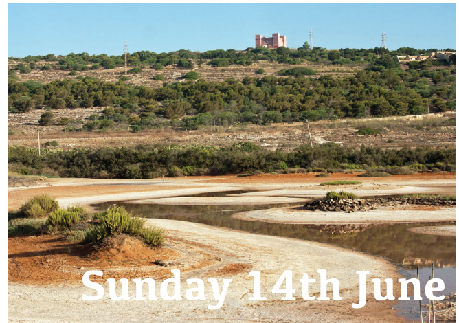
GHADIRA - Tim Micallef

For further information or for bookings please email events@birdlifemalta.org or call 2134764 5/6