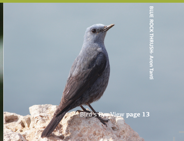
BLUE ROCK THRUSH- Aron Tanh