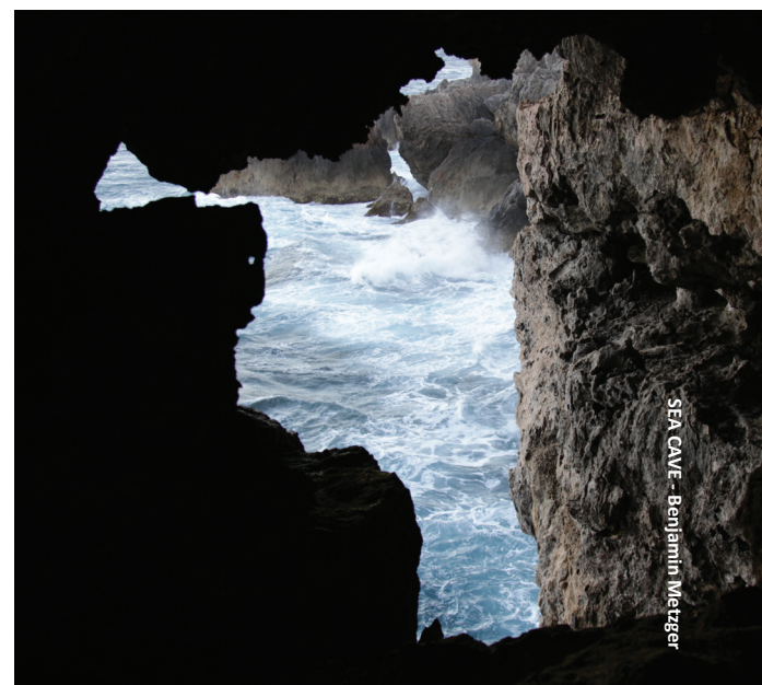
SEA CAVE - Benjamin Metzger