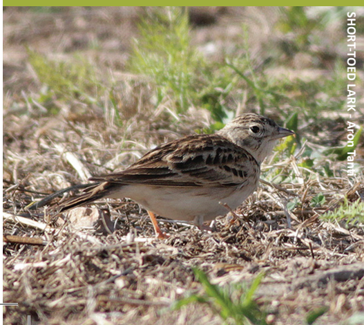
SHORT-TOED LARK - Aron Tanh

Blue Rock Thrush ( Merill ) can be seen singing from rocky outcrops