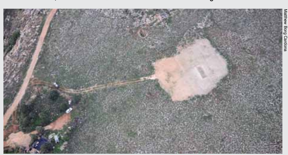
Ugly gash. Sticking out like a sore thumb, an active wader-trapping site at Ta' Lippija (Malta), with six nets and a pond; trappers and their cars are visible at lower left (photo taken 18 Nov 2011).

Despite the message being clear that Malta had failed to satisfy the derogation conditions, in autumn 2011 a trapping season was again opened, this time for Song Thrush only. The season was announced just a day prior to its start, and it allowed the trapping of Song Thrushes from 1 November 2011 to 10 January 2012. There was no bag limit whatsoever and no extra enforcement measures - so much for the obligatory conditions for derogation!