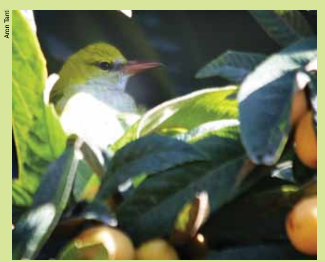
Fruity. A female golden oriole skulks in the foliage of a loquat tree.

A yellow flash darts among the trees: it is a male golden oriole, looking for juicy spring fruit to gorge on, such as white mulberries or loquats, or searching diligently for caterpillars among almond leaves. This bird is hard to miss, even when resting among the foliage of a carob tree. The female too is relatively easy to spot, despite her more greenish, less conspicuous plumage. This contrasts with their behaviour in their breeding sites in Europe, where they keep themselves rather concealed in the high deciduous trees in which they nest.