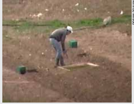
Caught in the act. (left) One of seven active finch-trapping sites discovered at Żurrieq (Malta). (right) A trapper at Qala (Gozo) removing Golden Plover decoys from his trapping site, after having replaced them with Song Thrush cages (both photos taken 26 Nov 2011).

If previous seasons had left loopholes for illegal trapping, this new season was no less accommodating. As expected, it resulted in widespread abuse.