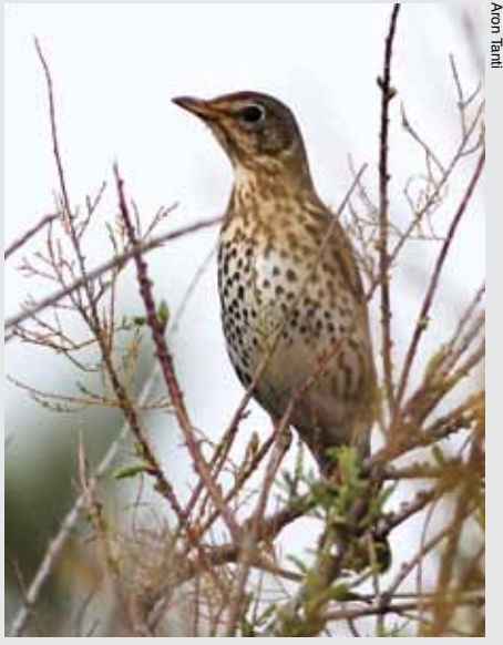
Quarry. The autumn 2011 open season for Song Thrush trapping led to another free-for-all that resulted in yet another illegal harvest of finches and waders.