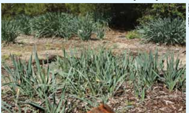
Return of the native. Vigorous new growth of Sea Daffodil flourishes in areas of sand dune newly cleared of acacias.