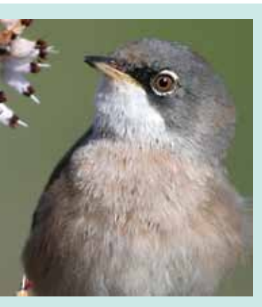
A Spectacled Warbler perches on a flowering shrub of Mediterranean Heath