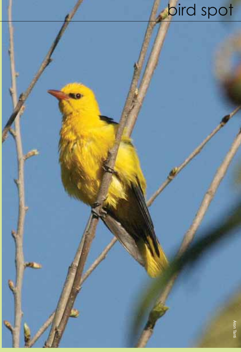
Flasher. The male golden oriole is unmistakable.

The adult male golden oriole has strikingly bright yellow plumage, with jet black wings and tail, both with a yellow patch on each side; the bill is reddish. When out of sight it makes its presence known by its beautiful song: a far-reaching fluting whistle, and very different from its nasal screeching calls. The female's colours are more subdued, with much less yellow than its mate, a whitish belly and throat and usually some streaking on the flanks. Juveniles and first-year birds have more streaking on the underparts.