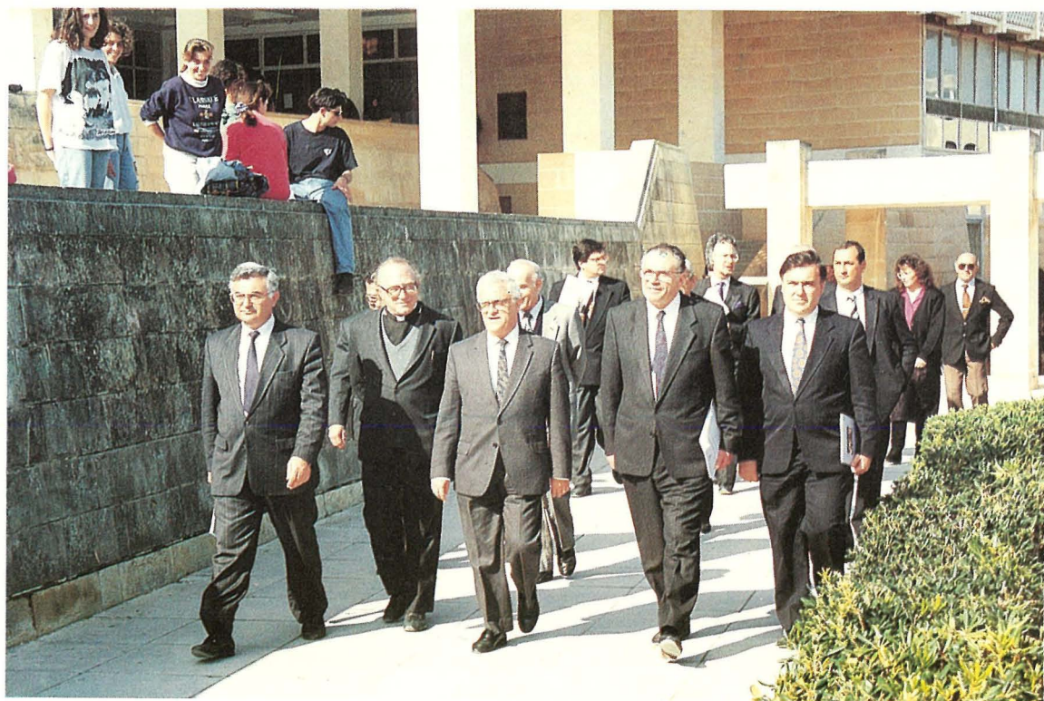
The Rector accompanies the Prime Minister and Ministers towards the new buildings.