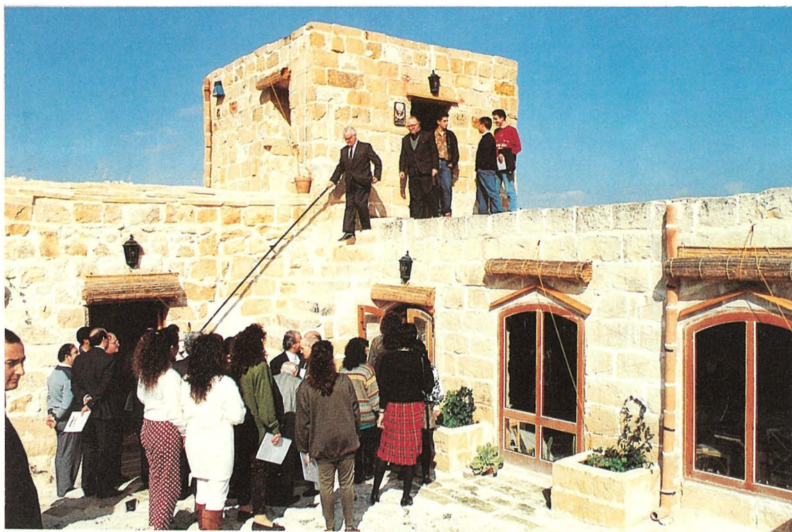
The Prime Minister visiting the Mediterranean Institute, a restored typical Maltese farmhouse.