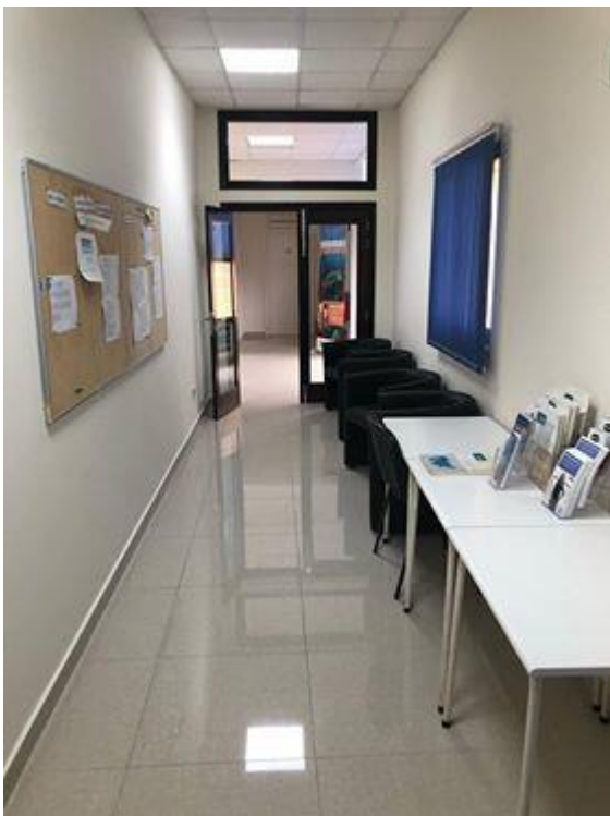
The new Walk-in Centre