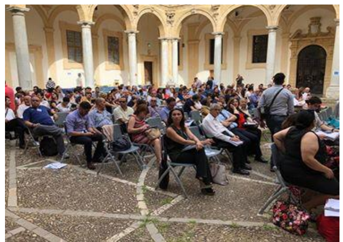
The cross-border consultation event