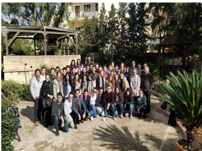
Group photo of participants in Gozo Seminar

It provides an opportunity for students to present their work on the dissertation and to obtain feedback from the Institute's academic staff as well as their fellow students. As in previous years, students found the experience positive and the feedback given to them to be very useful. In terms of overall comments on the quality of the workshops, the main feedback was positive though some commented that it would be useful to have the external tutors present too.