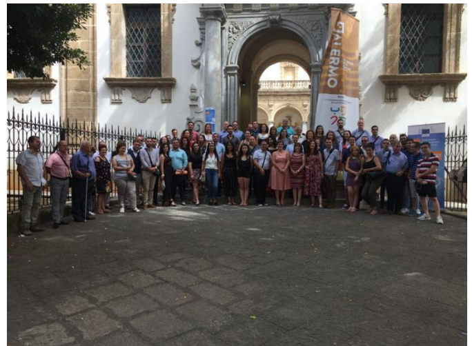
The Maltese participants in the cross-border project