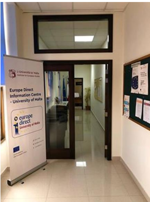
The EDIC Walk-In Centre on campus

Queries and EU information can be obtained by visiting the EDIC Walk-in Centre at the Institute or by calling 23402998 or by emailing edic@um.edu.mt .