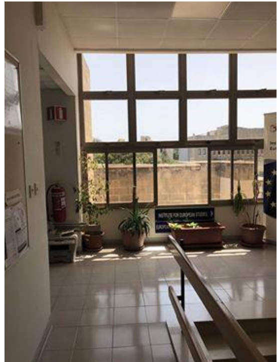
The old entrance

As the Institute's entrance now serves as the EDIC's walk-in centre, new furnishings were also installed, including a bespoke display unit for EU publications as well as armchairs. Below are images showing the refurbishment works.