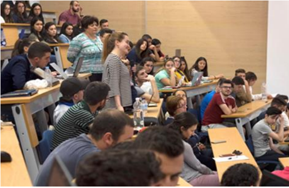
The audience at the event