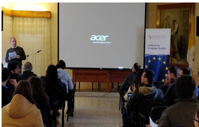
Presentation during the Gozo Seminar

As in the previous year, some commented that it would be more useful if the seminar was to be offered earlier in the course, but overall, as in previous years, students continue to recommend the seminar taking place.