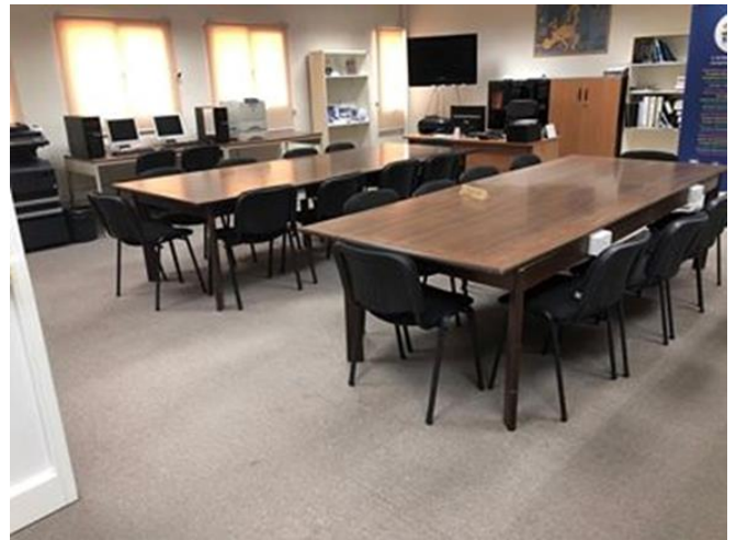
The EDC before the refurbishment