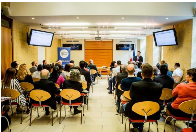
The audience in Europe House