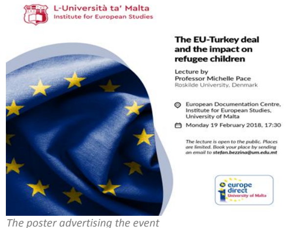
The poster advertising the event