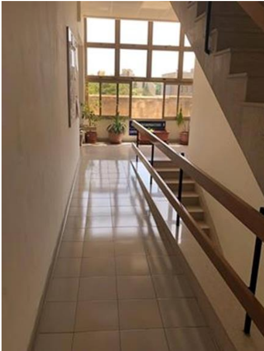
The old entrance way to the Institute

The Institute initiated major refurbishment works during the summer of 2018. The first phase involved the refurbishment of the shared entrance to the second floor, the Institute entrance hall, the outside offices as well as the EDIC. The refurbishment involved the removal of the old flooring, the laying of new tiles and the installation of new doors.