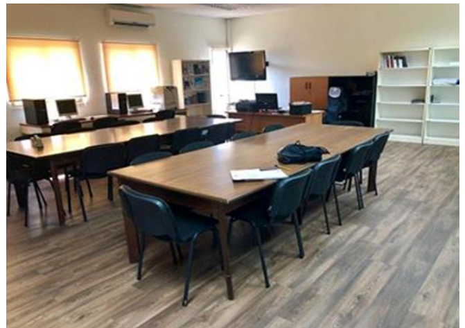
The EDC after the refurbishment