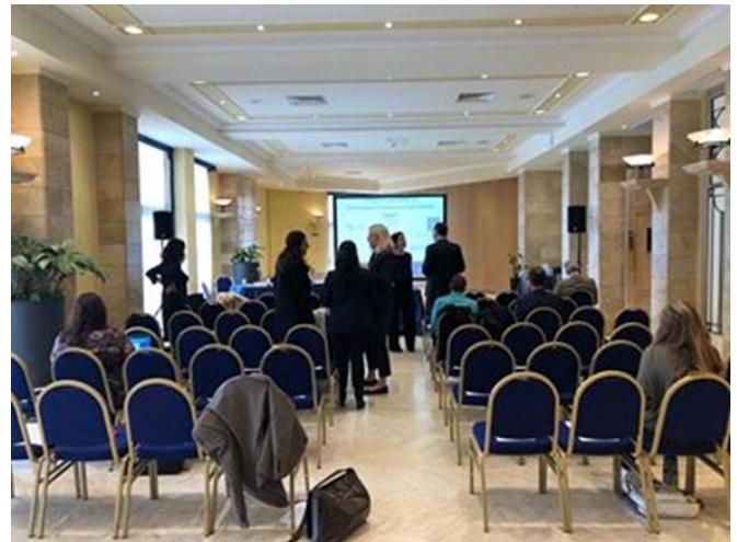
Participants before the event

The event was primarily financed by Malta Enterprise who also provided most of the logistical support in organizing the event.