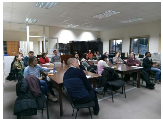
The audience at the event