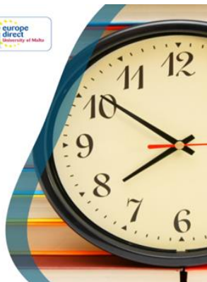
Poster advertising the extended opening hours

Thursdays 3, 10, 17, 24 & 31 May Tuesday 5 June Thursday 14 June