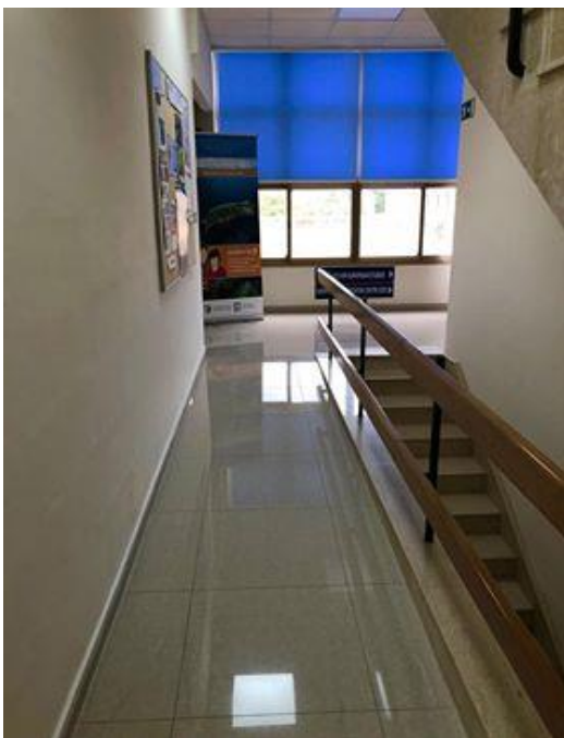
The new entrance way

As the Institute's entrance now serves as the EDIC's walk-in centre, new furnishings were also installed, including a bespoke display unit for EU publications as well as armchairs. Below are images showing the refurbishment works.