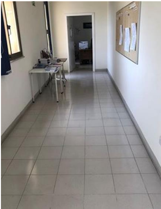
The old entrance hall