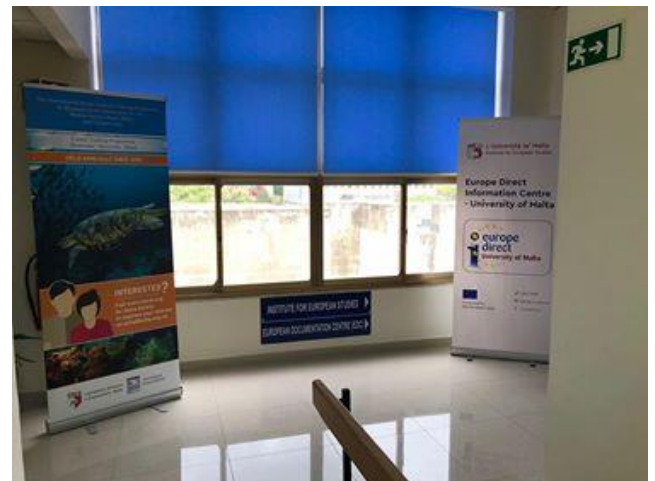
The new entrance

In the EDC, the work involved the laying of new flooring. This was a particular priority as the carpet in the EDC was exceptionally old and difficult to clean. By replacing the carpet with parquet, the library has become a cleaner and healthier place for students to study.