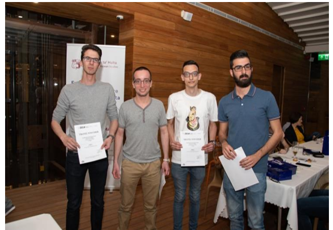
The winning team

The European Direct Information Centre and the Institute for European Studies organised a quiz night to celebrate Europe Day at Is-Suq tal-Belt , Valletta. The quiz was well attended and covered all aspects of Europe from the EU to football to music and many more topics.