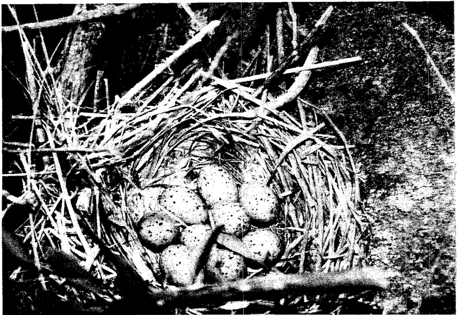
Nest of Moorhen, a new breeding species for Malta, see page 20.