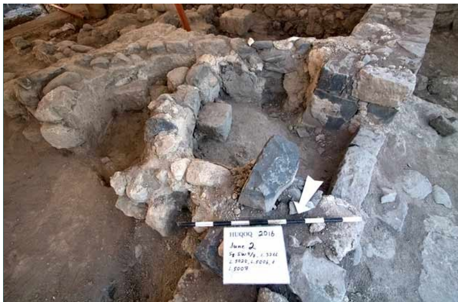
5. Two phases of a twentieth century semicircular entryway, looking south. (Images//G-6-2016-5.jpg)

Built teti-tu ( http://www.tetitu.co.il )