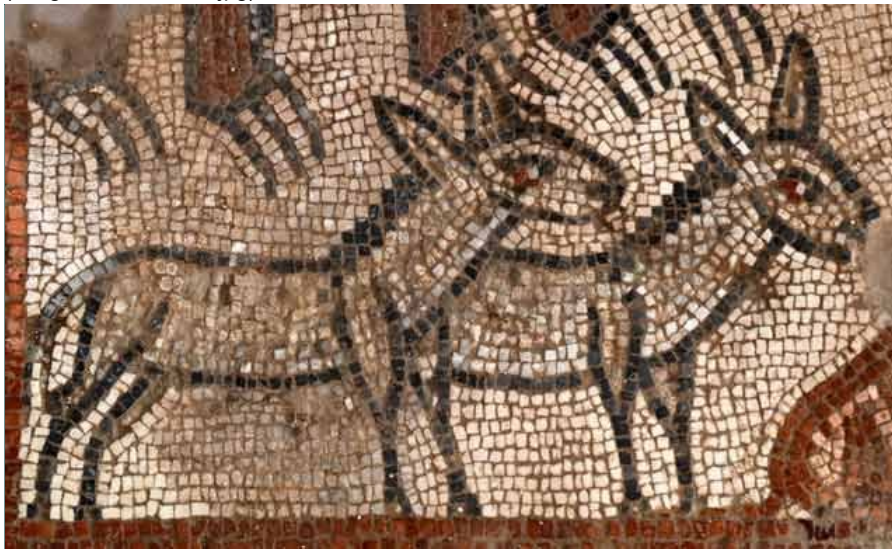
3. Pair of donkeys in the mosaic of Noah's Ark.