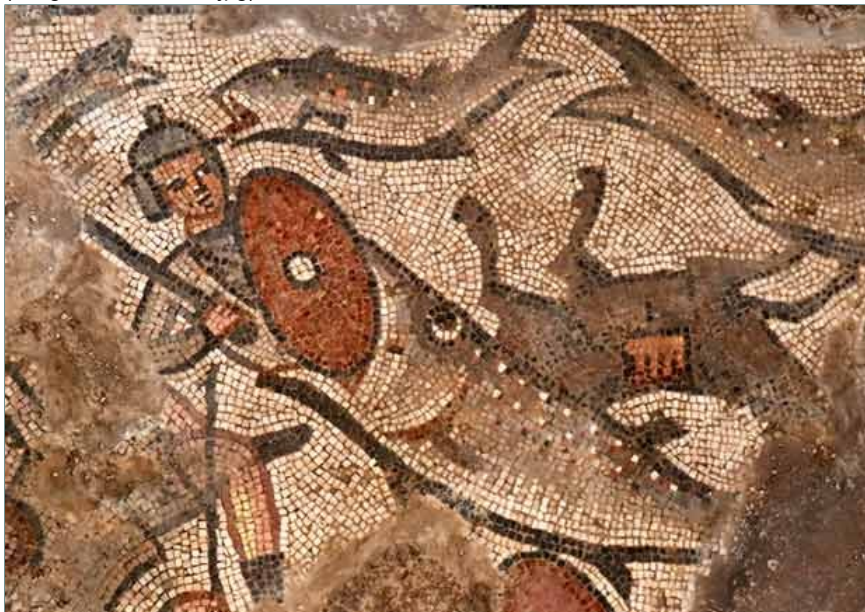
4. Fish swallowing one of Pharaoh's soldiers in the mosaic of the Parting of the Red Sea.