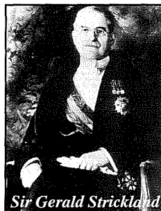
Sir Gerald Strickland