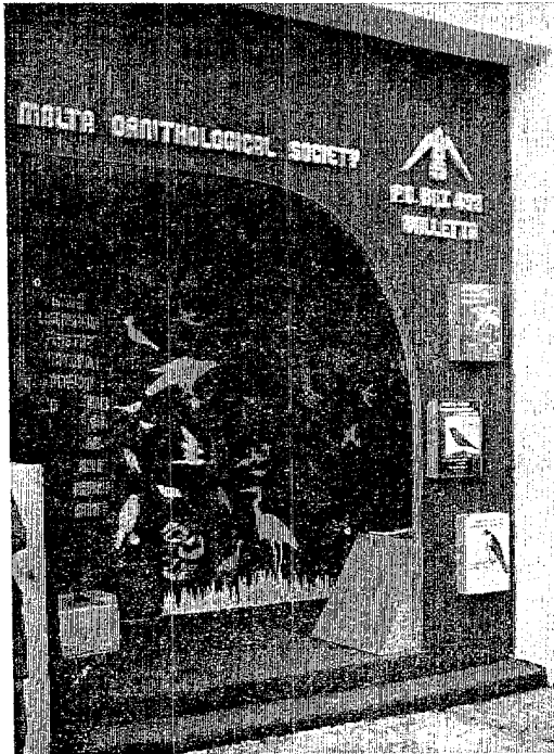
The MOS stand at the Malta International Fair July 1976.