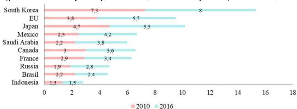
Figure 1. The share of the digital economy in the GDP of developed countries, %

It is fair to say that the practical implementation of the digital economy in the agricultural sector of the Russian Federation is hampered because it is explained by the following factors: