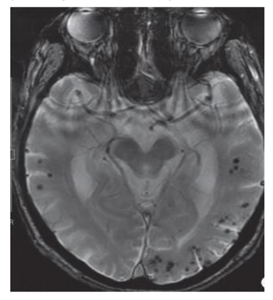
Figure 1: Multiple bilateral microhemorrhages in a lobar distribution <sup>12</sup>

Risk for eventual conversion to lobar intracerebral hemorrhage (ICH) is significantly increased at the sites of microhemorrhage. The risk for microhemorrhage is higher in local areas of confirmed CAA and is directly proportional to the density of amyloid deposition in blood vessels. Increasing numbers of microhemorrhages in a localised area may be suggestive of a future ICH so this can be used as a predictive tool. While most cerebral microhemorrhages are usually asymptomatic, microhemorrhages were associated with TFNE's in several case studies.<sup>6,11-14</sup>