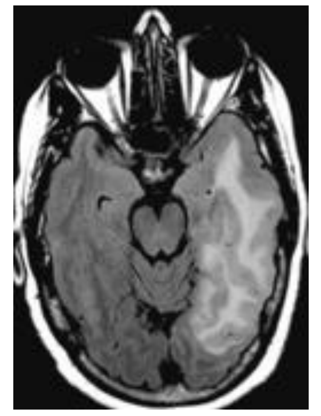
Figure 4 : Cerebral amyloid angiopathy-related inflammation involving left temporal and occipital lobes.<sup>26</sup>