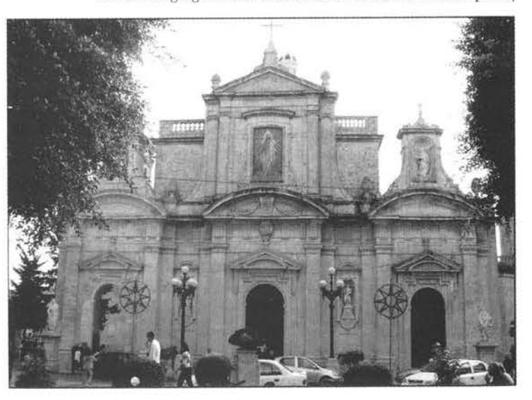
Façade of the church of St Paul, Rabat

Throughout his stay in Malta, Buonamici played a major role in bringing Maltese architecture in line with contemporary