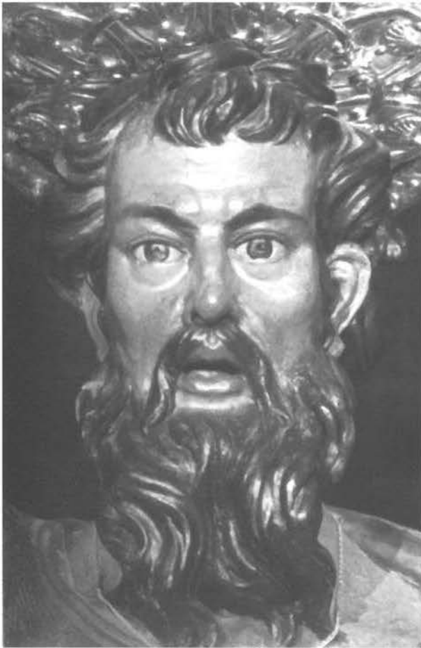
St. Paul, by Melchiorre Cafà, Church of St Paul Shipwrecked, Valletta. Detail.