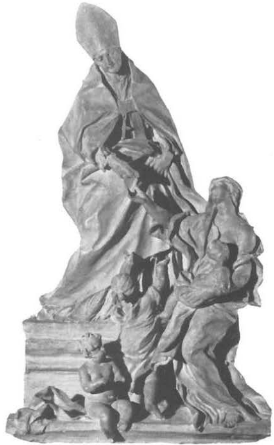
Charity of St. Thomas of Villanova, by Melchiorre Cafà, National Museum of Fine Arts, Valletta :