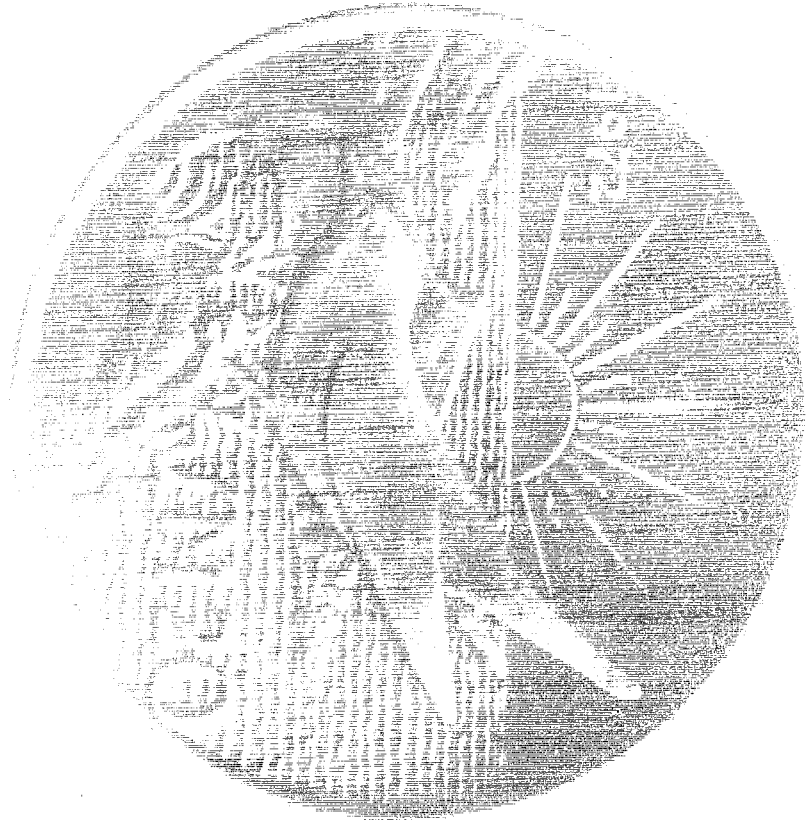
The 1920 gold coin which depicts the Pine Rock Finch.