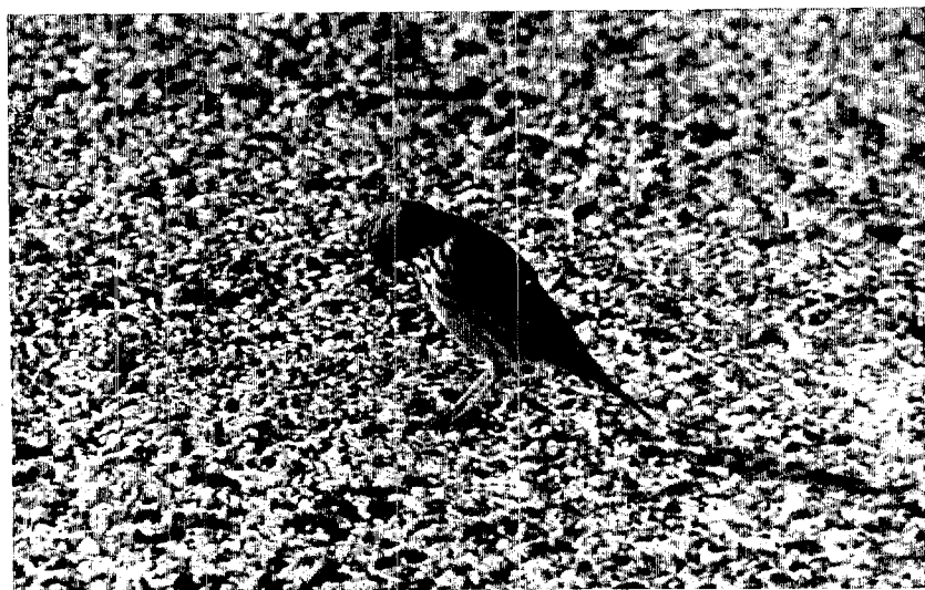
Meadow Pipit: common winter resident