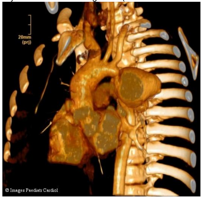
Fig. 23D-Computer tomography of the aortic arch demonstrating the native coarctation of the aortic arch (minimal diameter 0.5 cm) and the poststenotic aneurysm in the descending aorta (diameter 4.2 x 5.1 cm).

Fig. 3 Angiogram (lateral projection) showing the postoperative result.