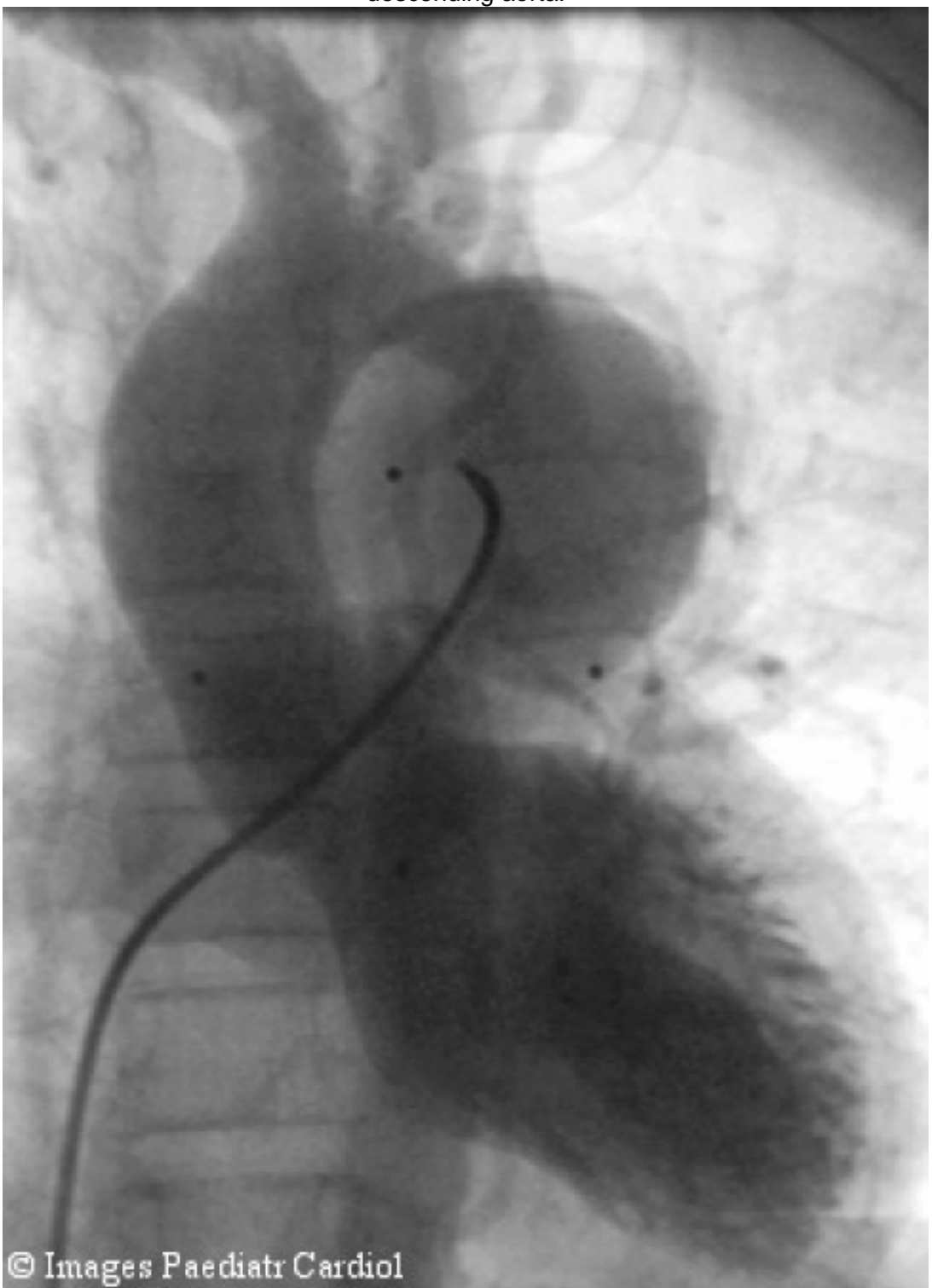
Fig. 1 Angiogram (frontal projection) demonstrating left ventricular hypertrophy due to the severe coarctation of the aortic arch with a giant poststenotic aneurysm of the descending aorta.

W Knirsch, C Schlensak, S Dittrich, C Kurtz, and D Kececioglu. Poststenotic aneurysm in a child with native coarctation of the aortic arch. Images Paediatr Cardiol. 2005 Apr-Jun; 7(2): 20–22.