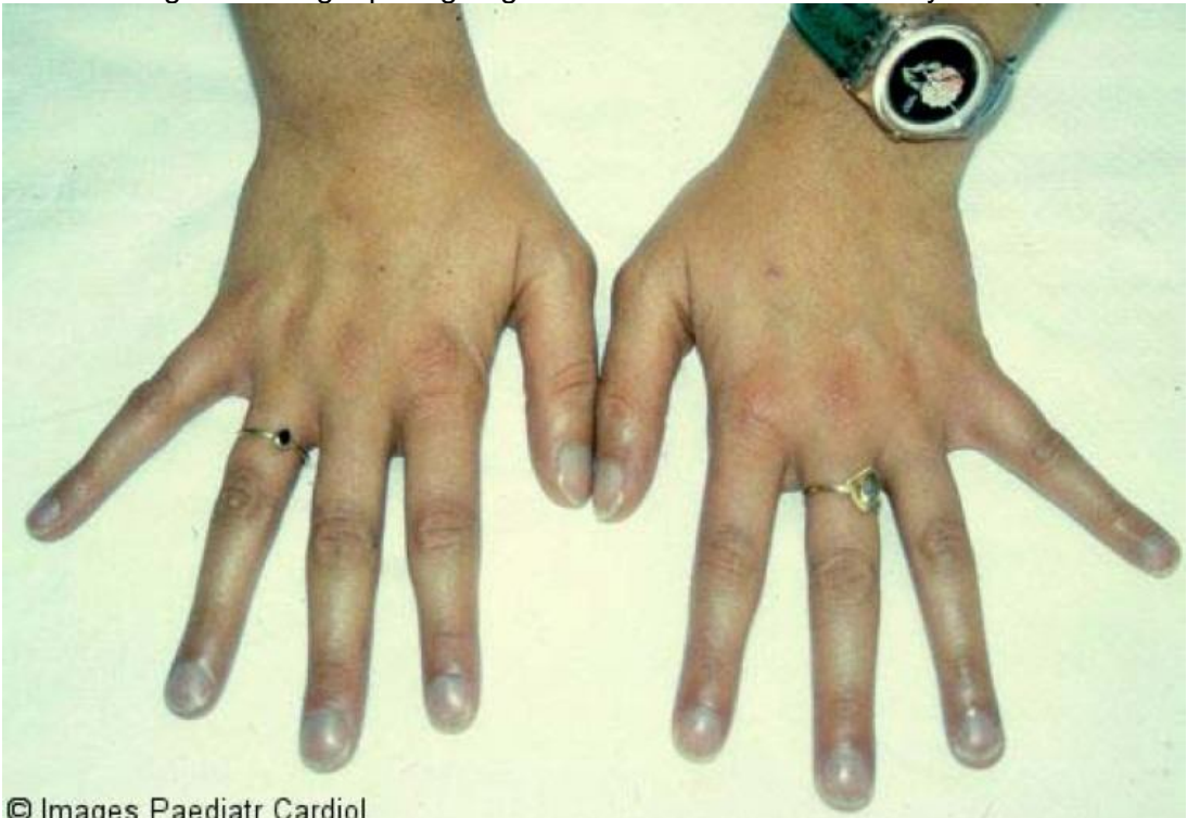
Figure 3 Long tapering fingers characteristics of Del22 syndrome

Skeletal anomalies and deformations have been detected in patients with del22.46-48 In the first reports, a variety of hand malformations and clubfoot have been described. Thereafter, scoliosis and vertebral maformations, including butterfly vertebrae and vertebral coronal cleft, have been added to the list. As characteristic diagnostic marker, most of del22 patients have long tapered fingers (Figure 3).