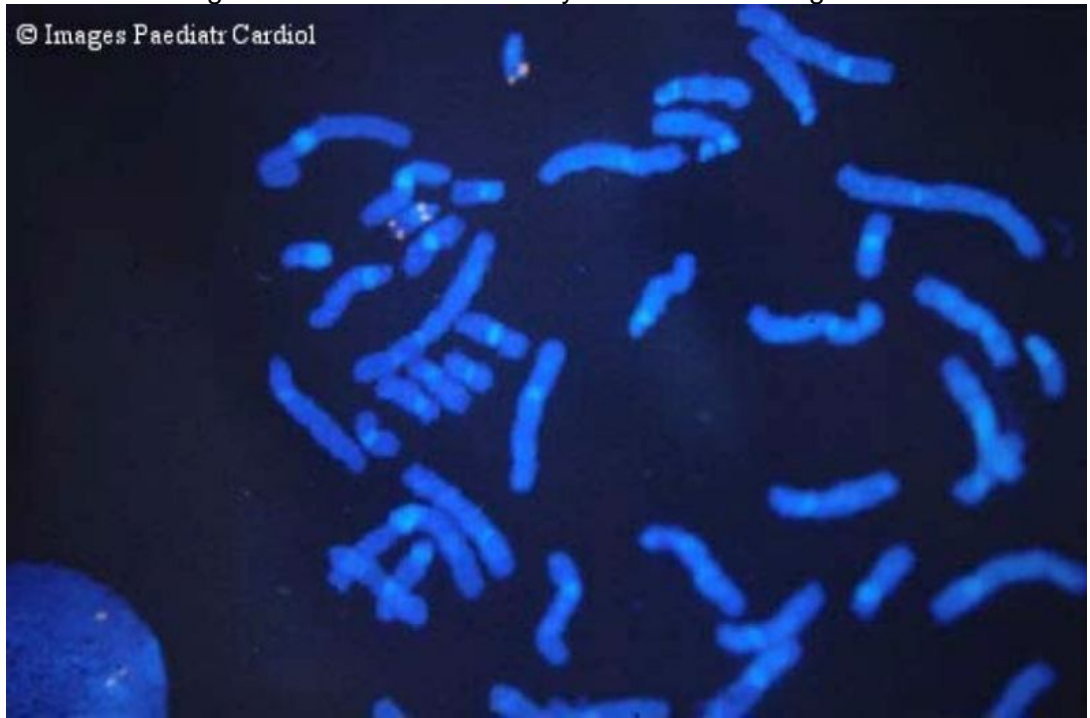
Figure 5 Fluorescent in situ hybridization showing Del22