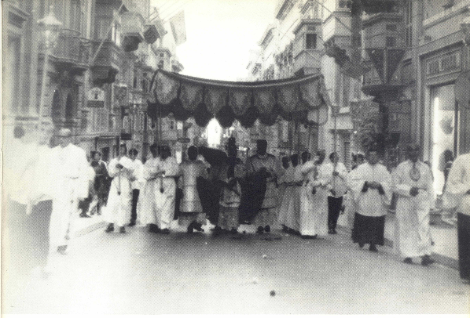
A familiar site in Valletta ... members of the Confraternity of the Sacred Heart of Jesus taking part in one of the traditional processions

THE LIST OF THE RECTORS OF THE ARCHCONFRATERNITY OF THE MOST HOLY SACRAMENT and of THE SACRED HEART OF JESUS erected in the COLLEGIATE CHURCH OF SAINT PAUL SHIPWRECKED in the CITY OF VALLETTA.