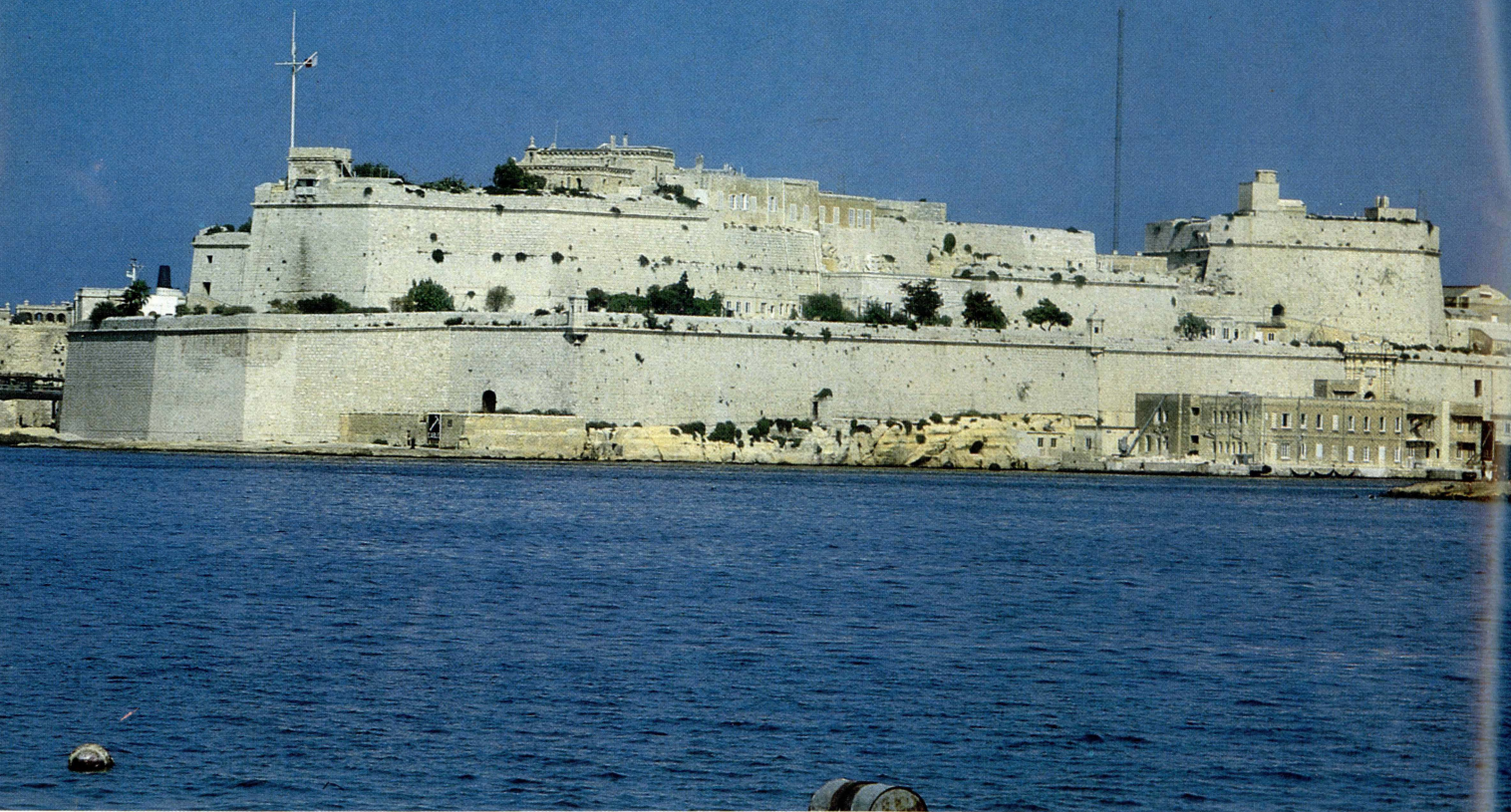
Fort St. Angelo ... first built by the Arabs?

establishment in Southern Italy during the early 11th century, the Normans thought of consolidating their position by acquiring and conquering new territories. In 1030 they were established in Naples and were thinking of extending the territories of the city. In 1084 they entered the city of Rome and sacked it. In 1071 the city of Catania was next to fall into the hands of the Normans. In 1090, during the month of February, the city of Noto was taken by the Normans. During July of the same year, the Normans, led by Count Roger, landed in Malta.