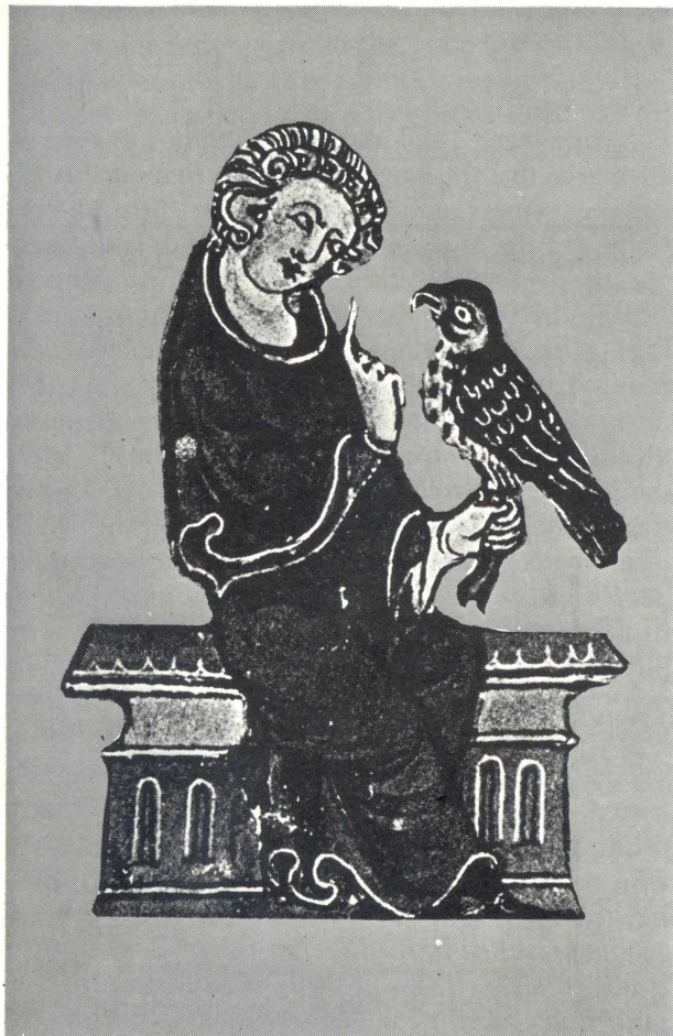
King Frederick I