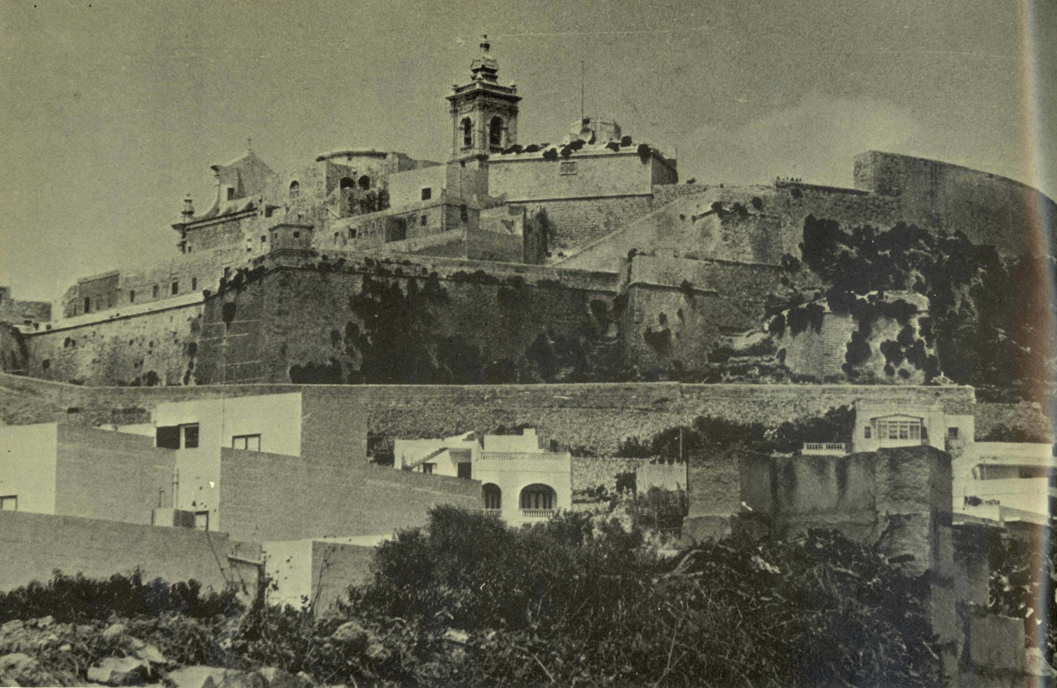
The Gozo Citadel . . . under the control of the università

was still safely inside. Due to other commitments in Sicily, the Aragonese fleet had to leave the Islands. But before they left, three hundred Catalan soldiers were left in Malta to help the Maltese rebels. It was only in February of 1284 that the French soldiers finally surrendered, due to lack of food.