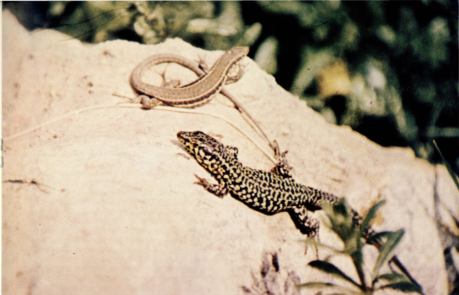
A male (lower) and female (upper) Maltese Wall Lizard from Gozo ( Podarcis filfolensis maltensis ). Male wall lizards tend to be more brightly coloured than females.