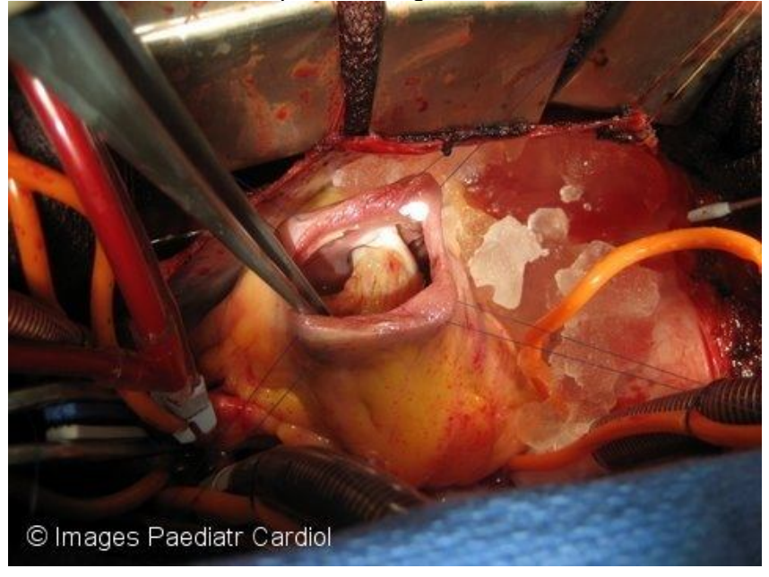
Fig 4 Extraction of intracardiac mass after resection at the stalk.

Fig 3 Metastatic Ewing's sarcoma attached to the ventricular muscle at the junction of the ventricular septum and right ventricular free wall.