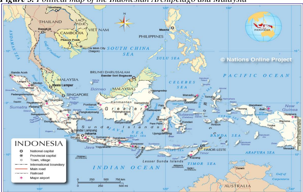
Figure 3. Political map of the Indonesian Archipelago and Malaysia<sup>35</sup>

This is how Chinese naval base location in the islands of Sumatra and Kalimantan, for example, exert direct influence not only upon the Straits of Malacca but also on the rest of the region, as can be seen in Fig.2. Chinese military plans in Indonesian waters are supported by a strong community of Chinese nationals and companies operating in the region reunited in the so-called bamboo network<sup>36</sup>. According to the 2010 census, there are more than 2.8 million Chinese living in the Indonesian Archipelago, representing 1.2% of the total population of the country<sup>37</sup>. But unofficial sources claim that the number of ethnic Chinese living in Indonesia would reach between 10 and 12 million people, including some who are 3rd and 4th generation, but who declared themselves Indonesians.