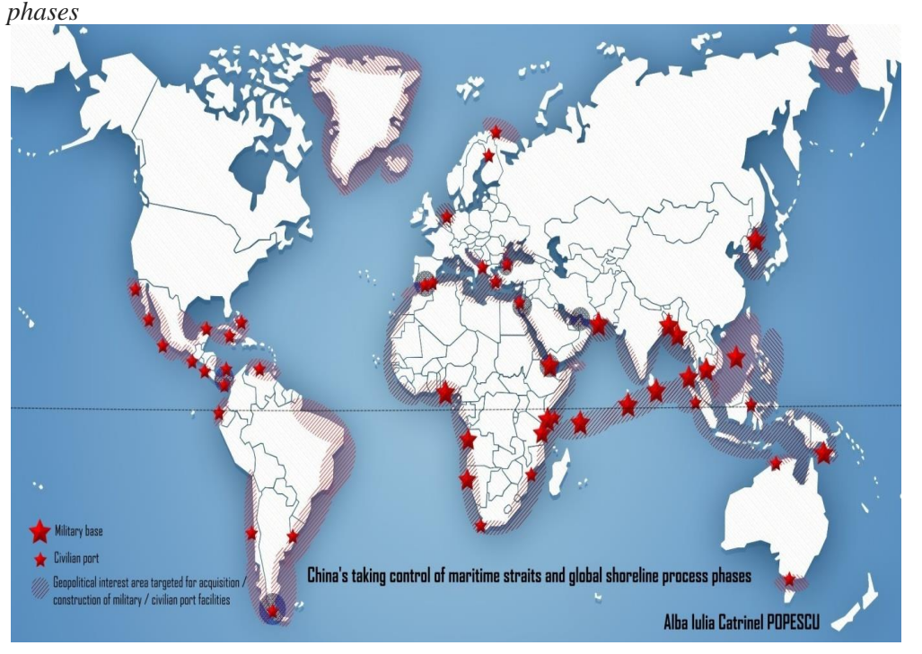
Figure 4. China's taking control of maritime straits and global shoreline process

The Danish Straits absence from China's immediate strategic objectives list, as well as the failure of taking over Iranian Chabahar Port management or the failure of economic taking over attempts of the Black Sea ports, should be regarded as the result of a non-confrontational policy against Russia in which Beijing does not want to test relations, for the moment.