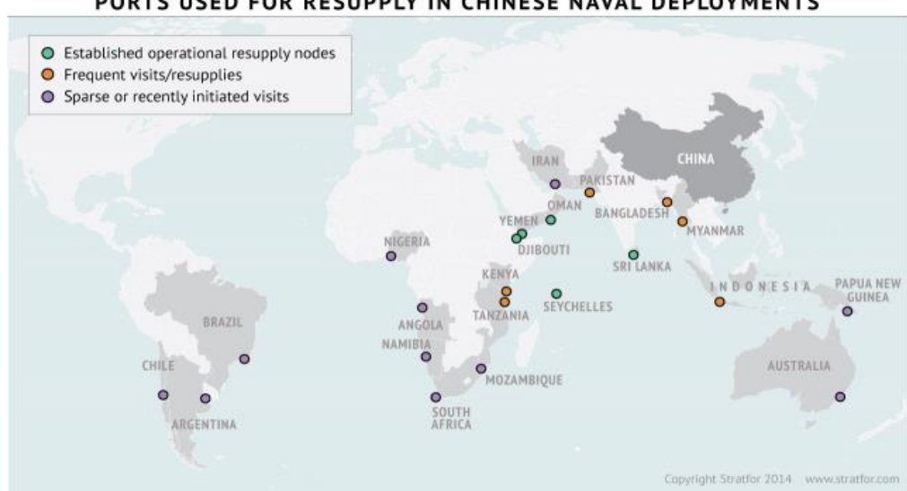
Figure 2. Chinese Overseas Strategic Support Bases Plan<sup>12</sup> PORTS USED FOR RESUPPLY IN CHINESE NAVAL DEPLOYMENTS

Information regarding Chinese plans to construct a string of 18 naval military bases along the southern shores of the Afro-Eurasian continental mass was originally unveiled in International Herald Leader, <sup>10</sup> a newspaper affiliated to the Chinese national media agency Xinhua News Agency, on January 4, 2013. A year later, the American agency Stratfor published an analysis <sup>11</sup> of the Chinese military plan in the Indo-Pacific area drawing additional public attention to the inclusion in this plan of three other South American states,: Argentina, Chile and Brazil (Figure 2).