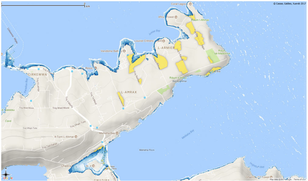
Figure 1b: Inundation map (at 5 m) highlighting SLR and storm surge impact over habitat areas.