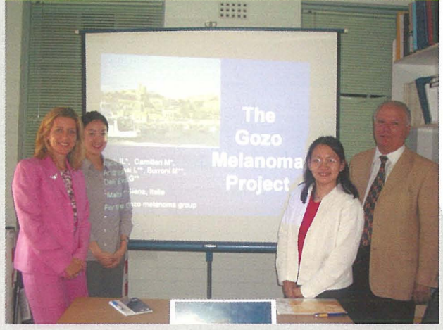
Lecturing in Sydney

As the founder and Honorary President of the Psoriasis Association of Malta, he is particularly keen and excited to point out the recent arrival of remarkable new psoriasis treatments (Biologic drugs), which could fulfil muchawaited hopes for psoriasis sufferers. "Unfortunately, treatment is still very expensive, costing in some cases close to €10,000 per annum per person. This sounds like plenty of money which it is, but when weighing the costs of providing this medication, the indirect costs of NOT