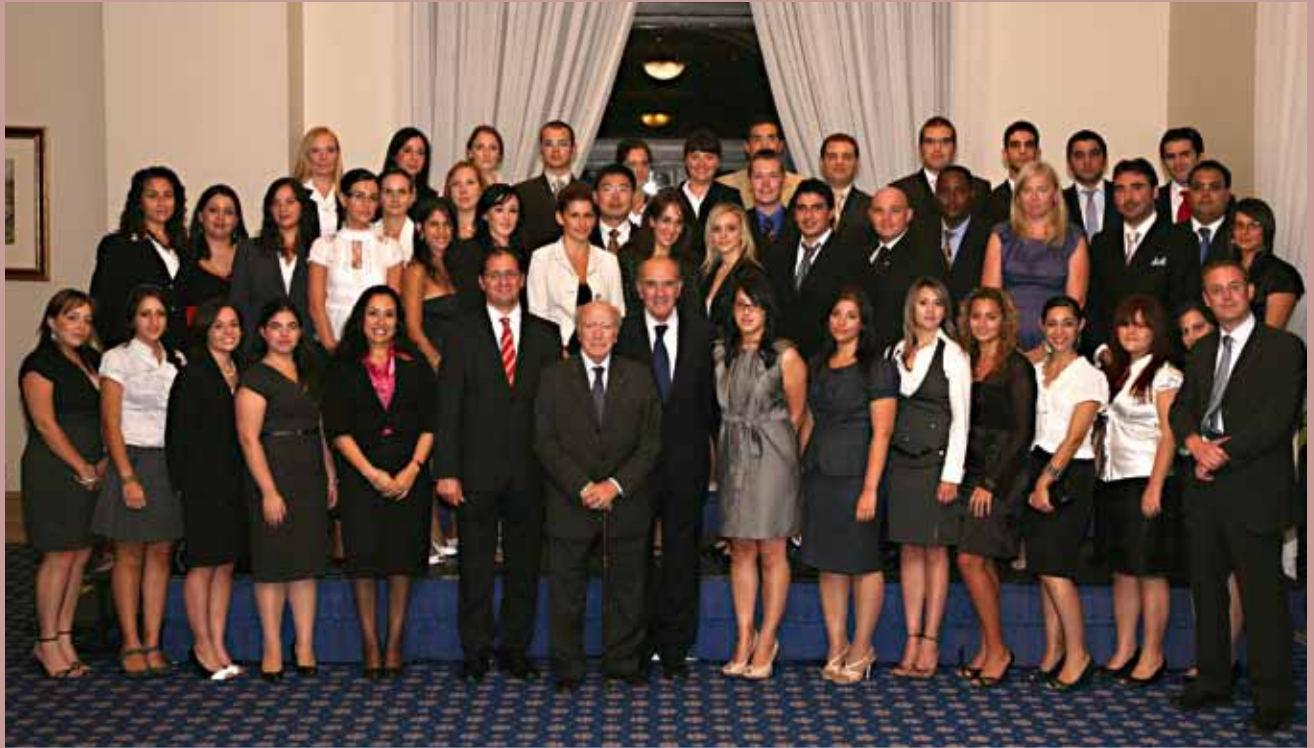
Group photo of MEDAC professors and students with Board Chairman Prof. Guido de Marco at the 2009/10 academic year opening ceremony.