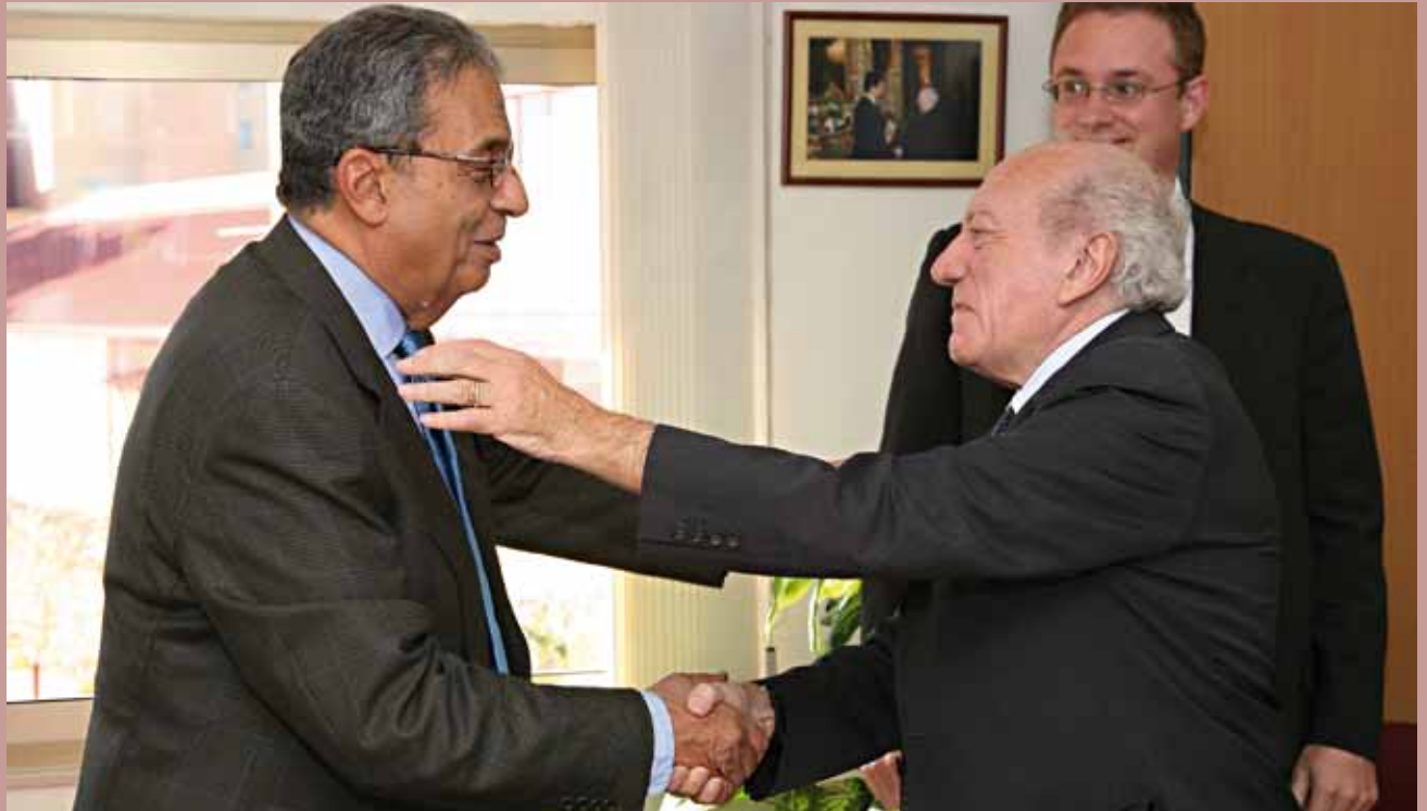
Hon. Amr Moussa then Secretary-General of the League of Arab States, was welcomed by Prof. Guido de Marco, President Emeritus of Malta, when he visited MEDAC on the occasion of opening of the Euro-Arab liaison office in Floriana in October 2009.