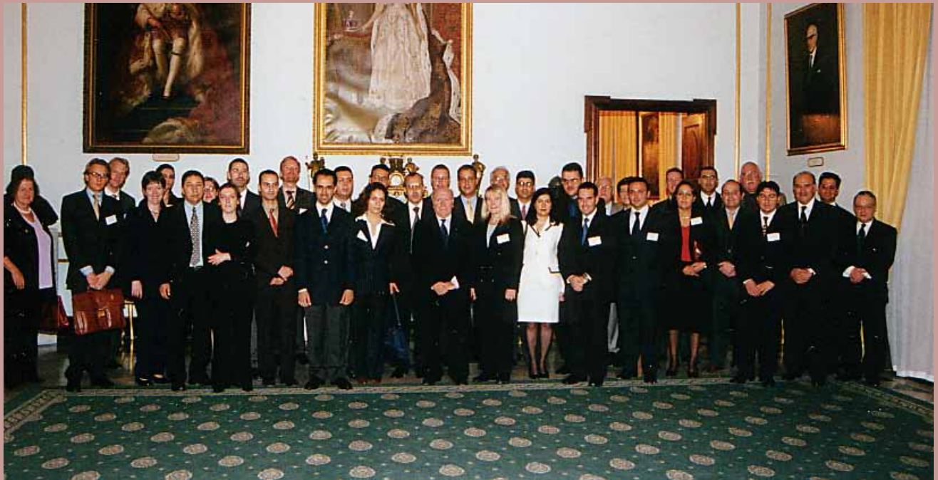
Participants of XIII Euro-Med Seminar (November, 2002) at the reception with President of Malta Professor Guido de Marco at the Presidential Palace, Valletta.