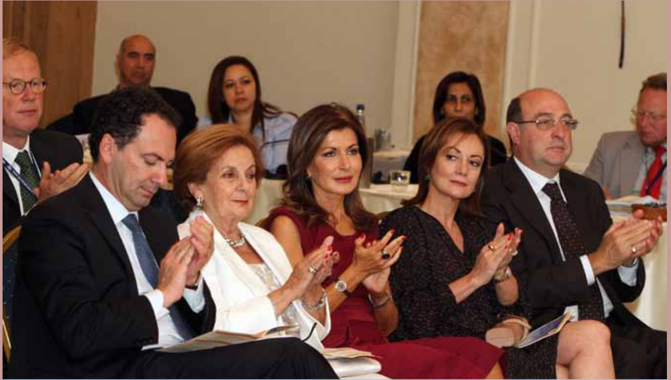
de Marco family members at the Tribute to Professor Guido de Marco