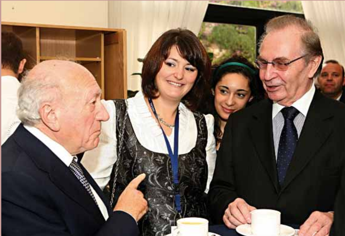
Prof. Guido de Marco (left) during the international conference “The end of the Cold War and the Mediterranean 1989 – 2009” with MEDAC students and Ambassador Alexander Bessmertnykh (right), former Foreign Minister, Russian Federation.