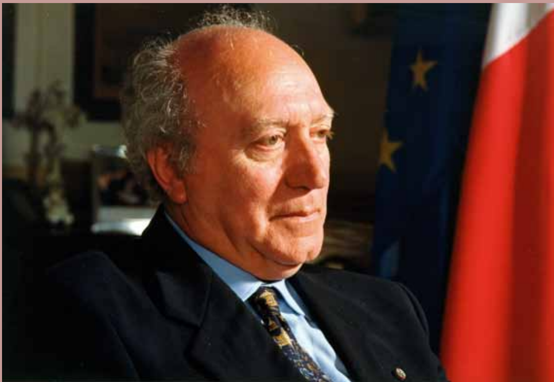
Prof. Guido de Marco. A photo-portrait from 1990s as the Deputy Prime Minister and Minister of Foreign Affairs of Malta.