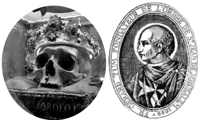
Blessed Gerard – skull and portrait 20

management of the Benedictine Order. 19 The first reference to Geraldus, a man of upright conduct serving the poor in the Jerusalem Xenodochium before the 1099 Siege of Jerusalem, was found in the late 12 th century chronicle written by William, Archbishop of Tyre [d.1186]. During the siege, the Fatimid Governor Iftikhar-ed-Daula ordered the arrest and examination under torture of Gerard who was charged with concealing treasure and maintaining communications with the enemy.