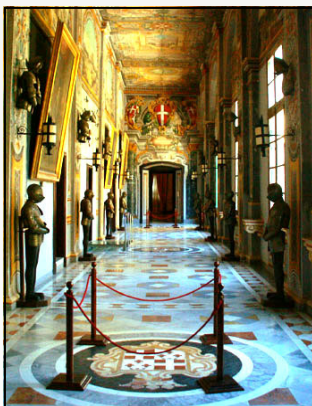
Grand Master's Palace, Valletta

The Welcome Reception will be held at the Grand Masters Palace under the Patronage of His Excellency Dr. George Abela, President of the Republic of Malta on Monday, 8th March 2010.