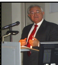
Hon. Mr. John Dalli during his speech on Wednesday the 11th March 2009.

The next distinguished guest was the Hon. John Dalli who delivered a talk on Wednesday about the ever-increasing challenges facing the pharmacy profession. Hon. Dalli emphasised the importance of pharmacoeconomics mentioning as a case in point, the Pharmacy of Your Choice (POYC) system. He stated that the whole scheme is to be reevaluated in an exercise that will involve all the stakeholders, including the Pharmacy Department.