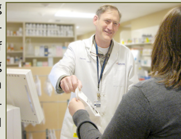
The pharmacist providing the medication to the patient.

The POYC scheme was implemented as a pilot project in December 2007 with the aim being that of facilitating the patient's life. Through this system the patient is able to collect free medicines from the preferred pharmacy of ones choice and most importantly from the pharmacist of the patient's choice. There are various benefits of the POYC system, an important one being that the pharmacist will know the conditions the patient is suffering from and what medication is being taken for the treatment of the associated condition. Adverse reactions and drug interactions, amongst others, are identified and prevented from occurring. This will ensure optimal pharmaceutical care and drug usage. The drawbacks of this system include the workload, time constraints due to added administrative work, necessary computer software upgrades as a professional tool for more effective clinical interventions and the maintenance of adequate medicine stock levels.