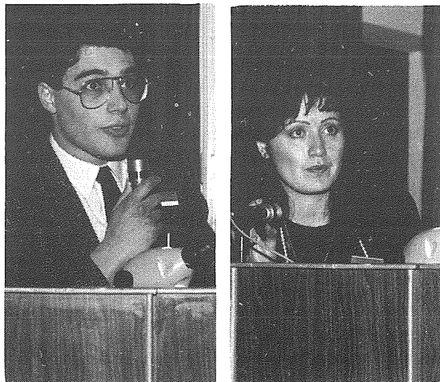
Two students making their presentation.