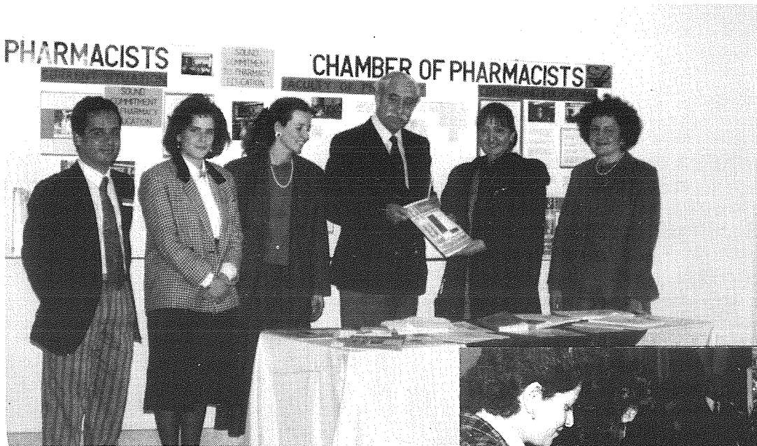
The Chamber of Pharmacists' stand.