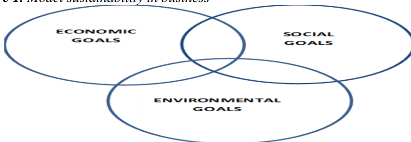
Figure 1. Model sustainability in business