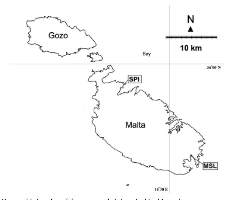
Fig. 1 — Geographic location of the two sampled sites cited in this study.

A checklist of Mollusca was drawn up for two coastal locations (Fig. 1) on the island of Malta – St. Pauls Island (= Selmunett Island; 35°57'57.64"N,